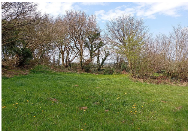
View Of Top Gardens