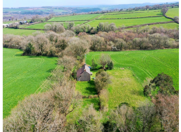
Aerial View 2

Barn 1 - 10' 5" x 12' 0" (3.19m x 3.68m) With further potential (subject to any consents required) and currently used for storage.