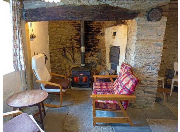
Lounge With Inglenook