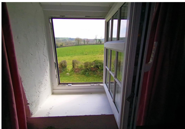
View From Master