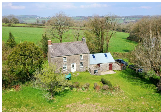
Aerial View 3