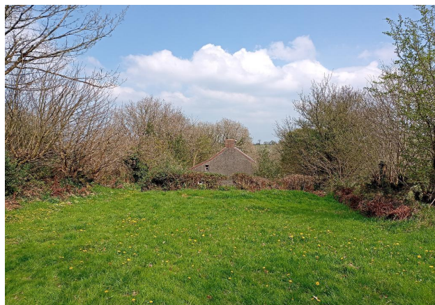
Side View Of House And Gardens