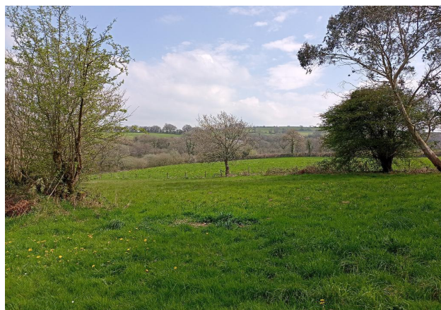
Gardens And Views