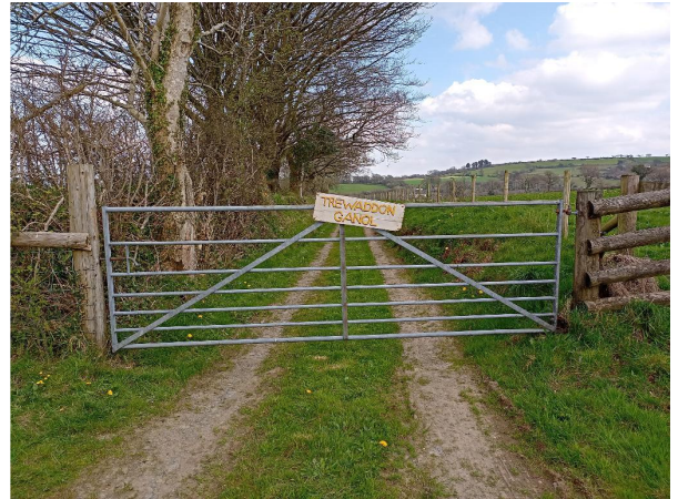
Track To House