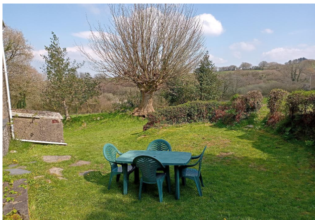
Lawned Gardens Near House