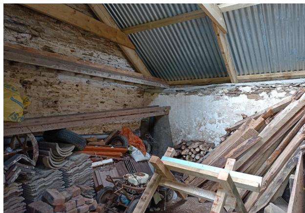
Barn Section 2