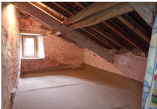
Small Childs Bedroom