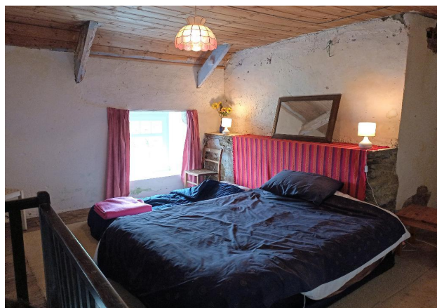
Master Bedroom 1