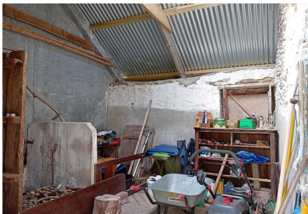
Barn Section 1