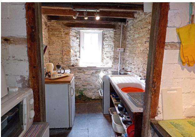
Kitchen View 2