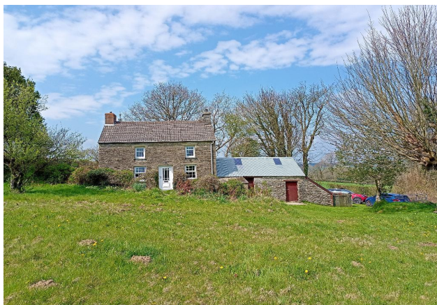
Another View Of House