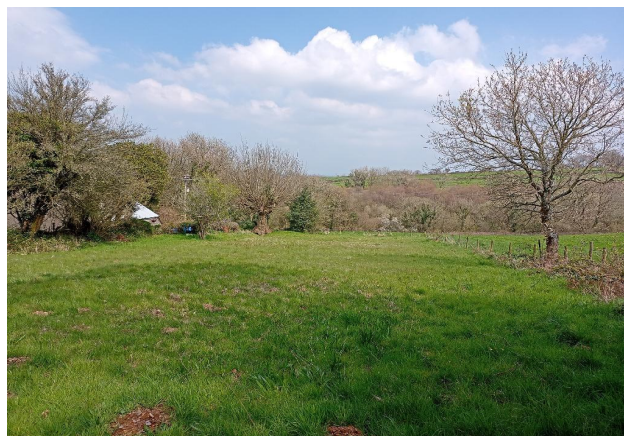
Land And Views