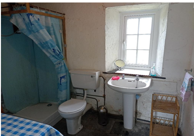
Downstairs Shower Room