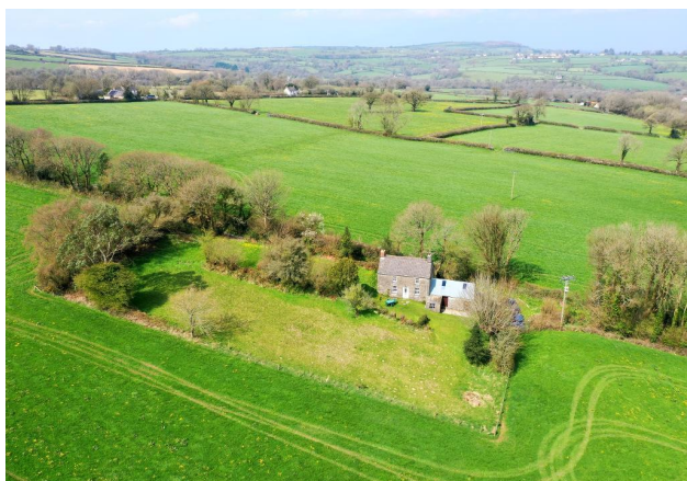
Aerial View 5