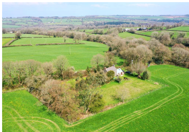
Aerial View 4