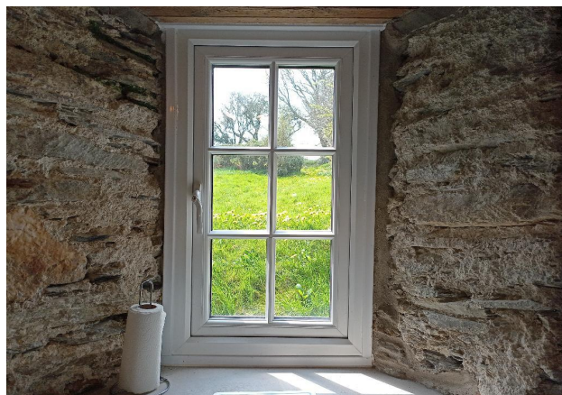
Picture Window In Kitchen