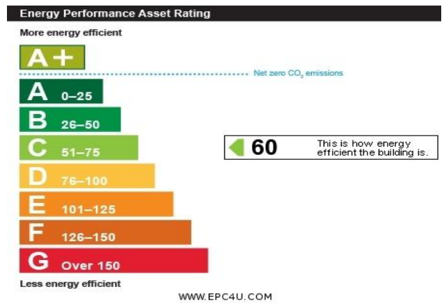
Commercial EPC for Ground Floor