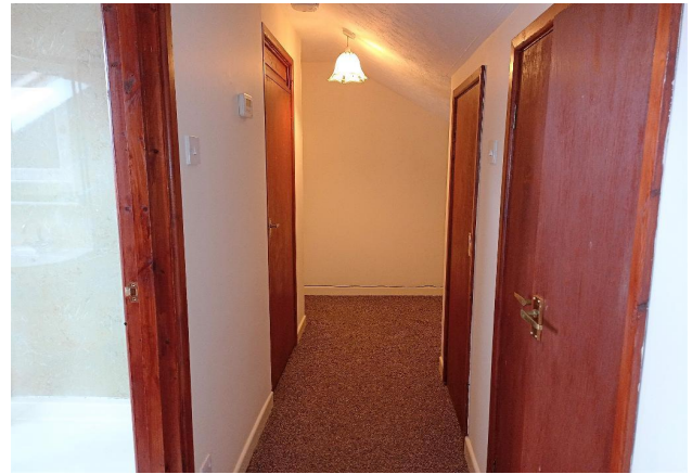
Second Floor Landing