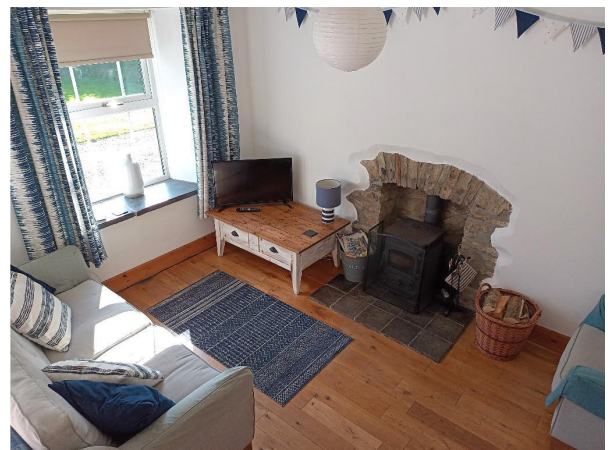
Lounge from Kitchen