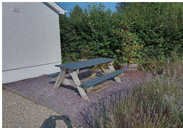
Gravelled Patio Area