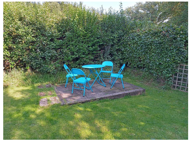
Rest and Relaxation