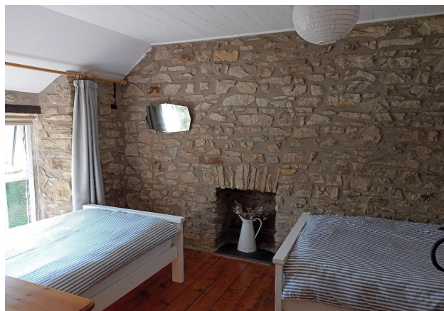
Bedroom - Another View