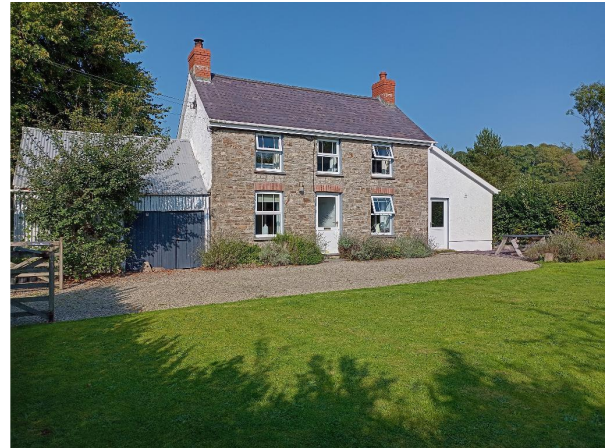
Another Main View