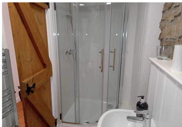
En-Suite Shower - Another View