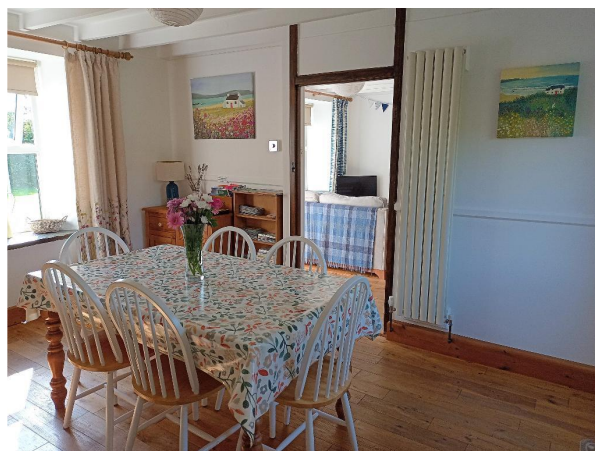
Dining Room - Another View