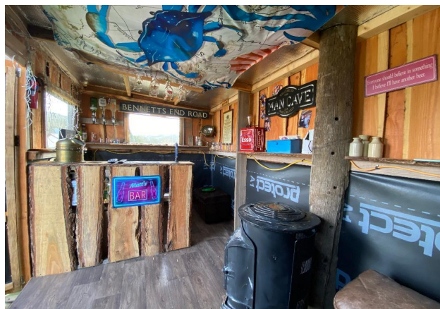
Outbuilding / Bar