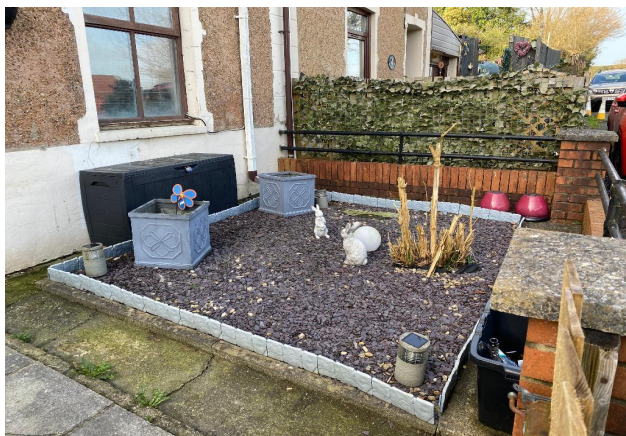
Front Courtyard Area