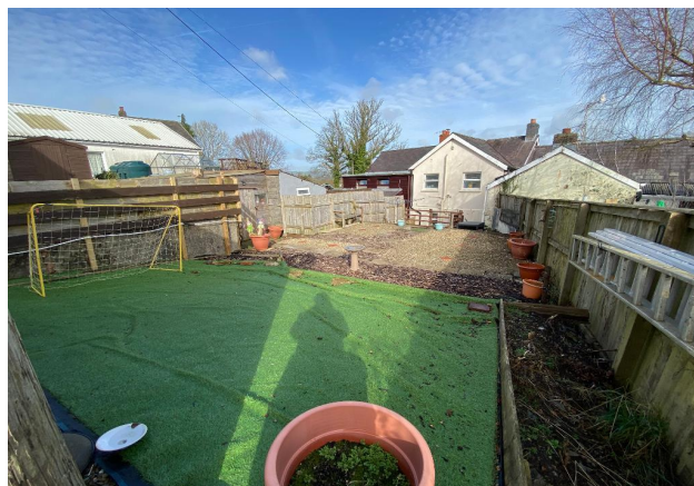
View of House From Garden