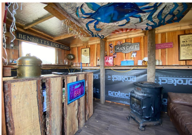
Outbuilding / Bar