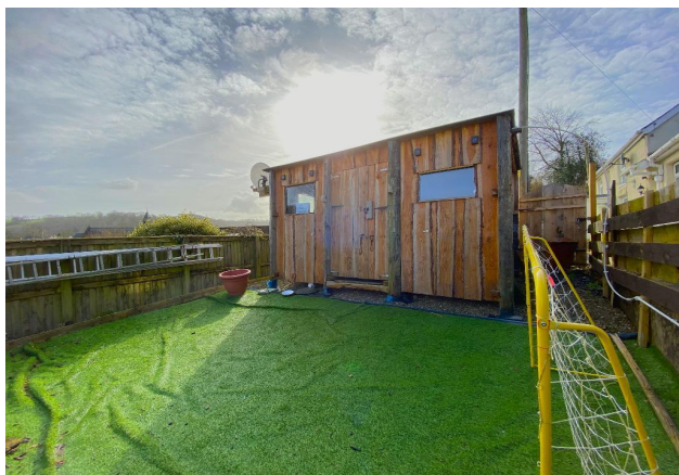
Timber Outbuilding / Bar