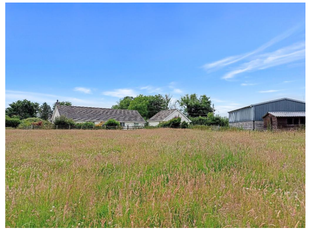
View Of Property From Land

The Land - The 50 acres of land is divided into 8 main enclosures and is predominantly gently sloping pasture, currently used to graze sheep but could equally be used for cropping. The land can be accessed via the