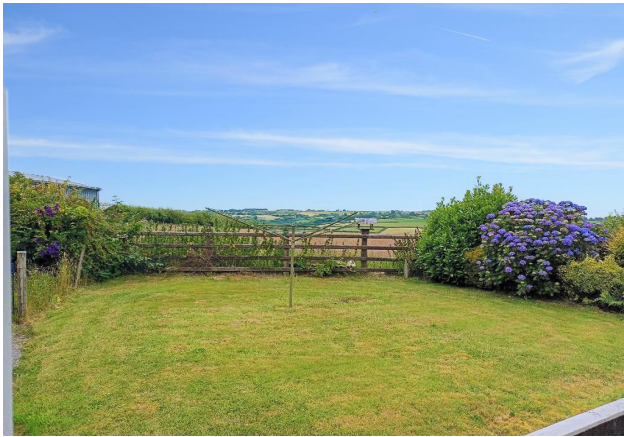
View From Bedroom