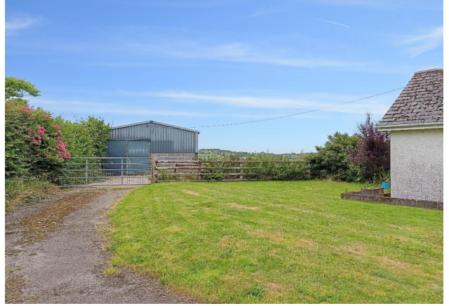
Access To Outbuilding