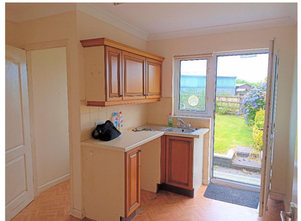
Utility Room with WC off