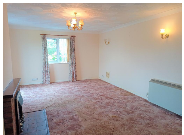
Lounge - Another View