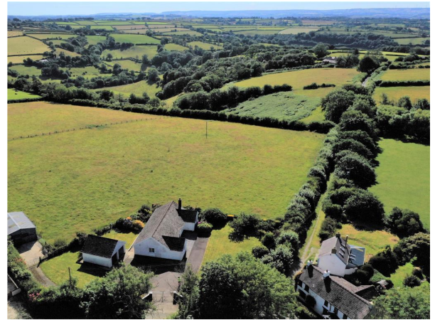
Land and Views