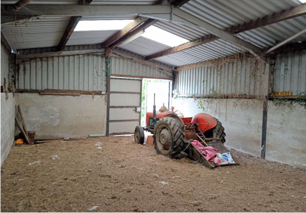
Inside Agricultural Outbuilding