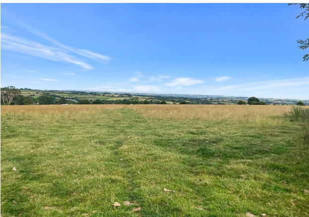
Land And Views