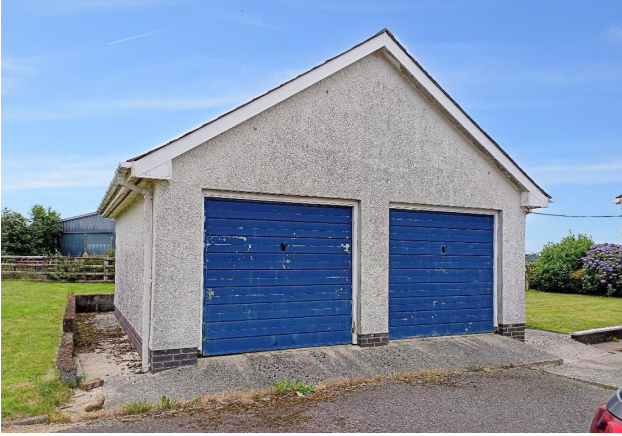
Detached Double Garage