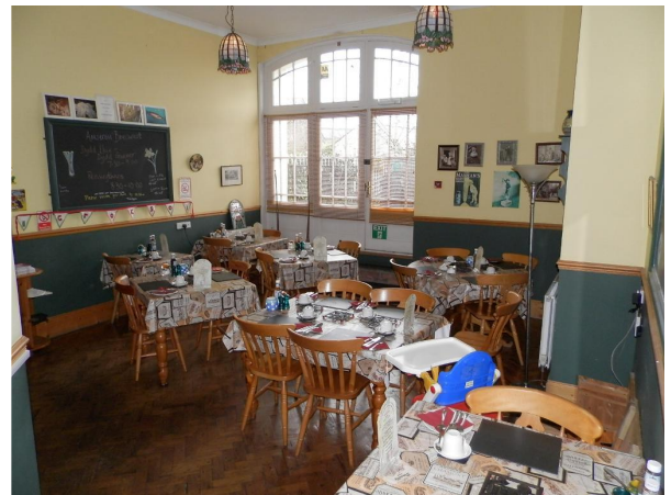
Breakfast Room - Another View