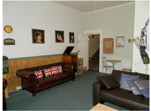
Guest Lounge / Bedroom 6