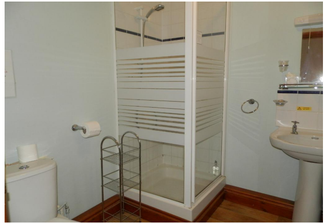
Bedroom 3 En-Suite