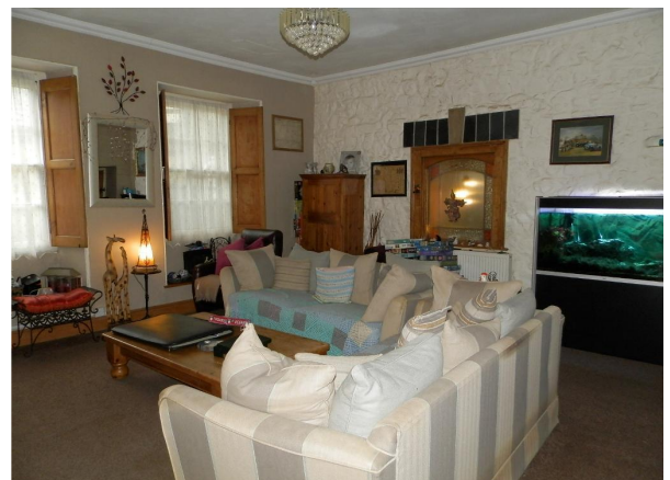
Owners' Lounge - Another View