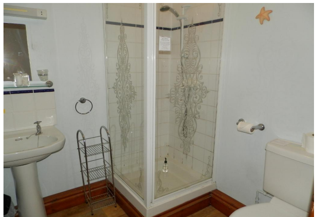
Bedroom 4 En-Suite