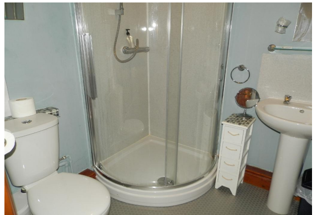
Bedroom 1 En-Suite