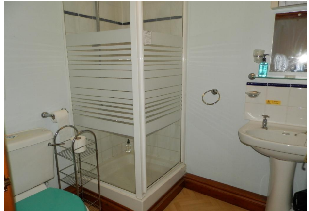
Bedroom 2 En-Suite