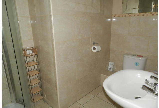
Bedroom 7 En Suite