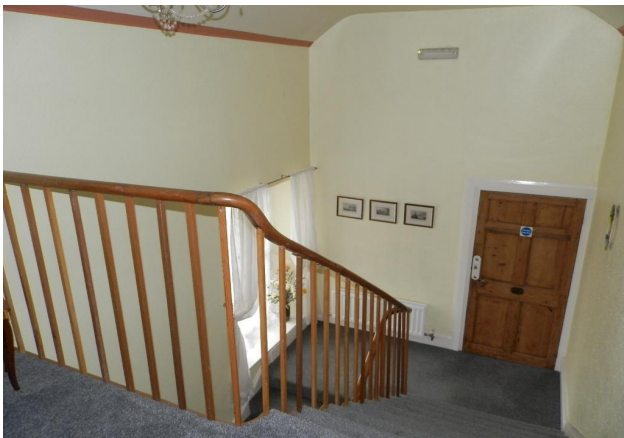
Second Floor Landing