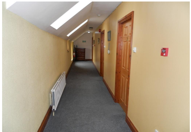
Second Floor Hallway