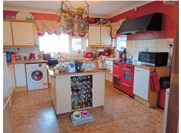
Kitchen / Breakfast Room