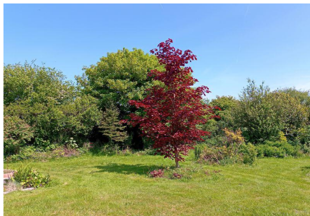
Gardens in May 2023