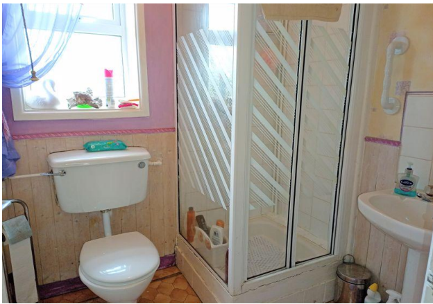
Downstairs Shower Room