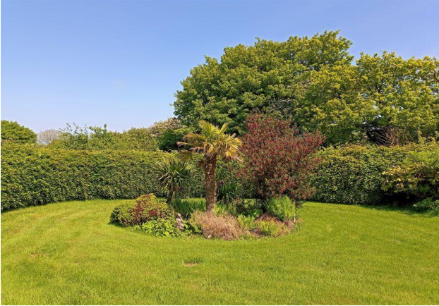
Gardens in May 2023