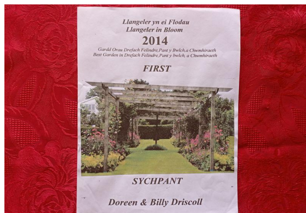
Garden Awarded in 2014