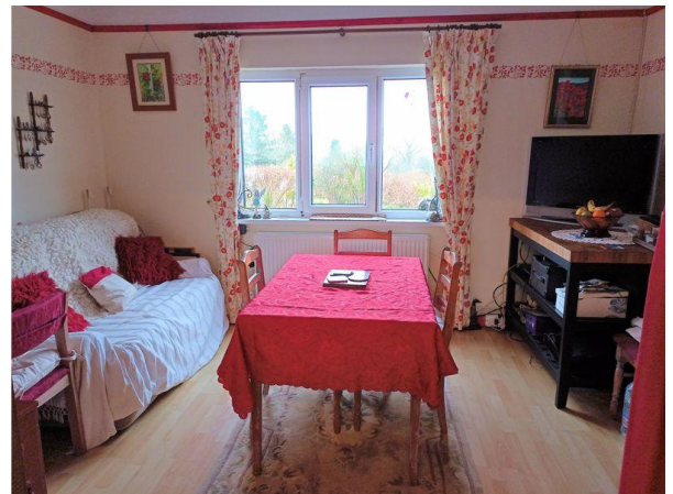
Sitting / Dining Room