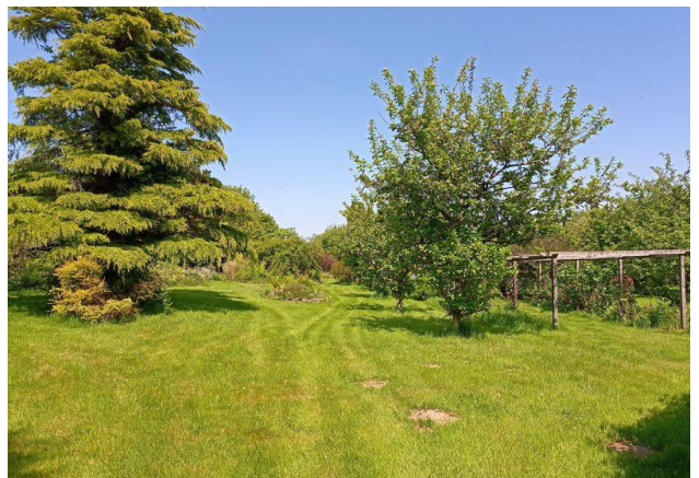
Gardens in May 2023