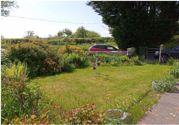
Front Garden - May 2023