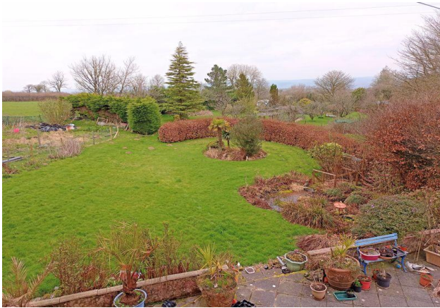
View From Landing Area