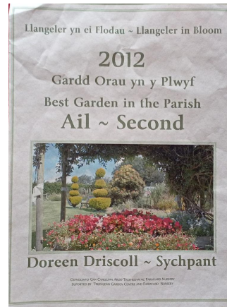
Garden Award in 2012