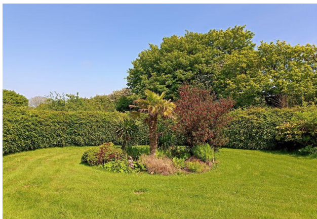
Gardens in May 2023