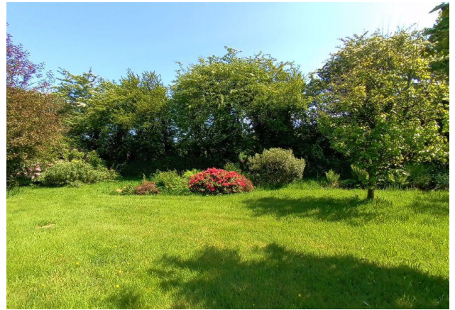
Gardens in May 2023