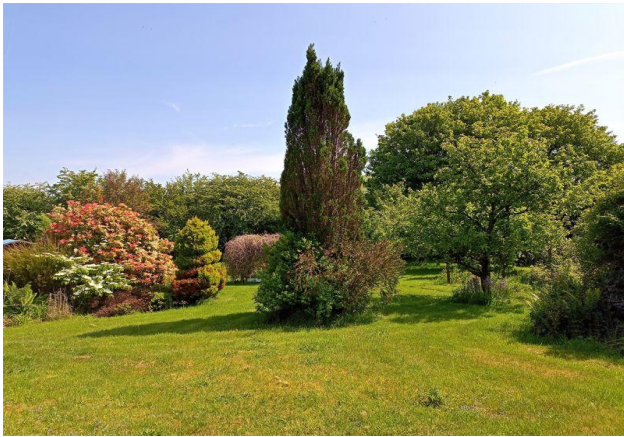
Gardens in May 2023