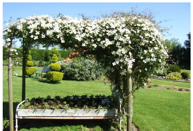
Old Summer Garden Image