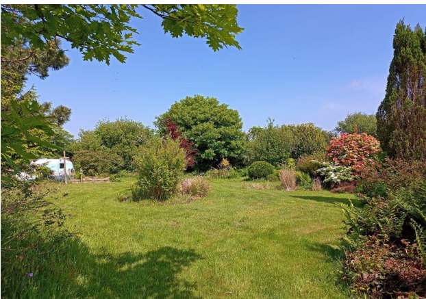
Gardens in May 2023