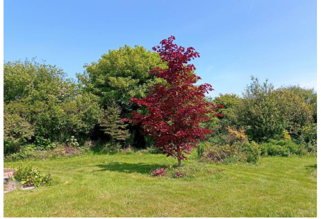
Gardens in May 2023