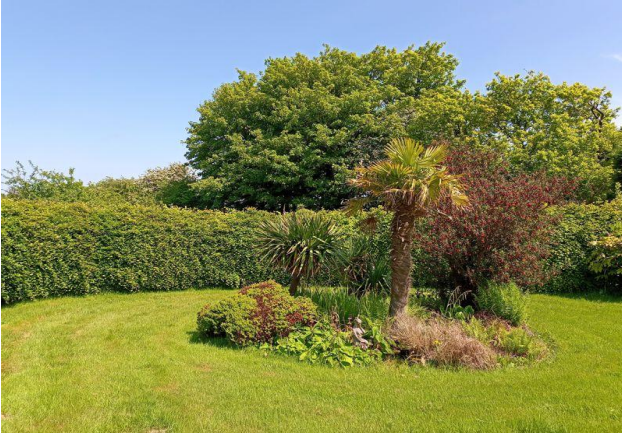
Gardens in May 2023