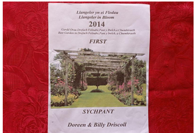
Garden Awarded in 2014