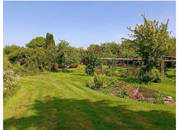
Gardens in May 2023