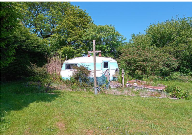
Gardens in May 2023