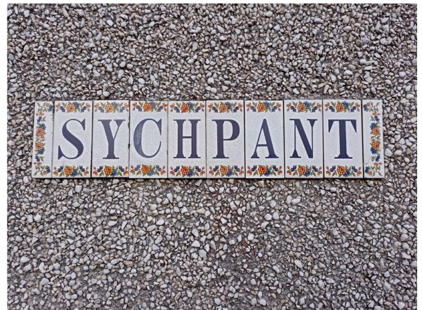
Sychpant Name Plaque