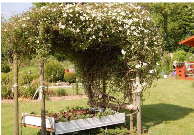
Old Summer Garden Image