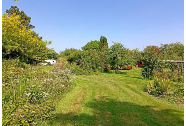
Gardens in May 2023