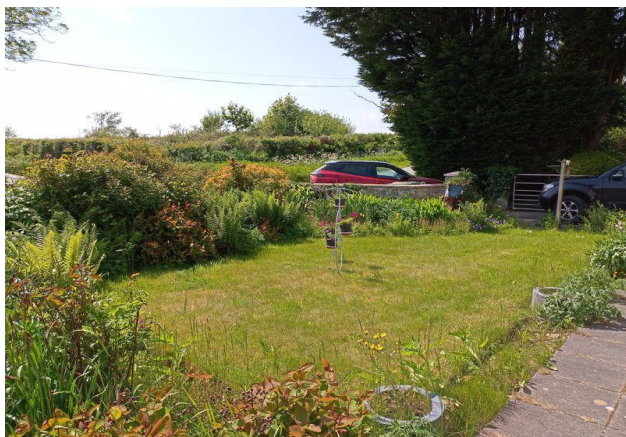
Front Garden - May 2023