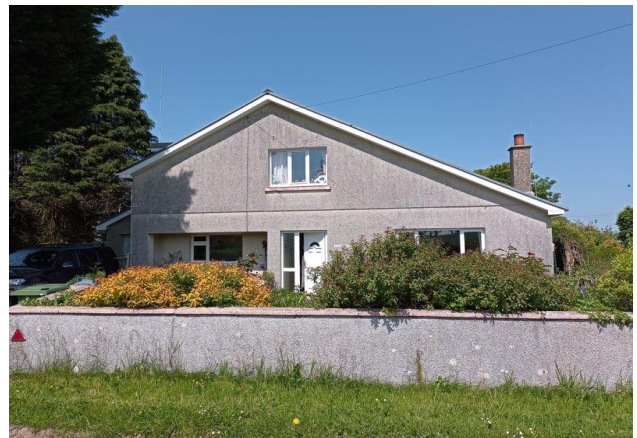
Front View of House