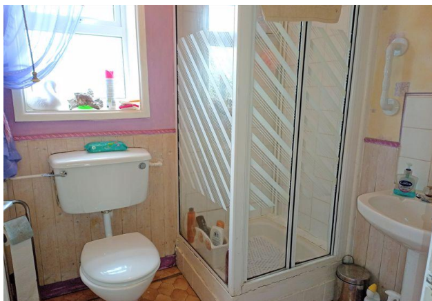
Downstairs Shower Room