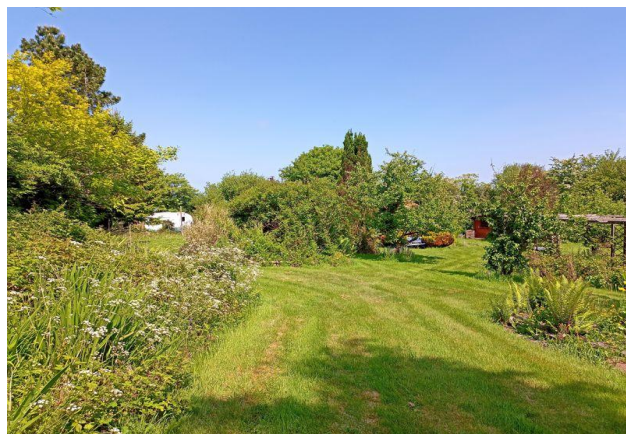
Gardens in May 2023