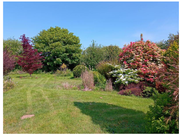
Gardens in May 2023

Externally - The grounds amount to around an acre of gardens to the rear of the property with far reaching views. As can be seen from the Award pictures our clients have previously won several awards for their beautiful gardens and used to open them to the public for various charity events, but sadly, due to ill health, are no longer able to maintain it in the way they were able to previously.