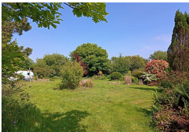
Gardens in May 2023