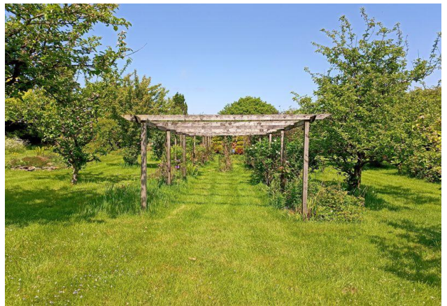
Gardens in May 2023