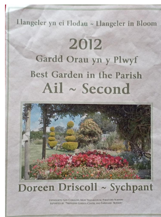
Garden Award in 2012