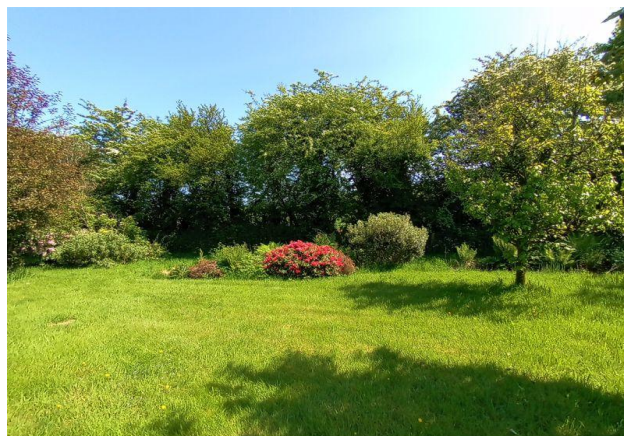
Gardens in May 2023