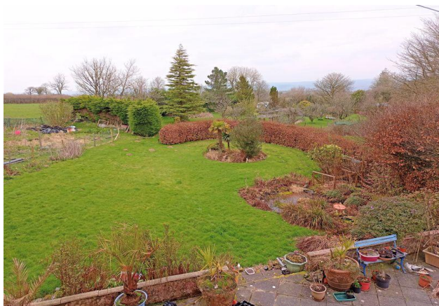
View From Landing Area