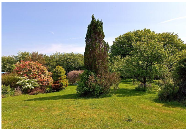
Gardens in May 2023