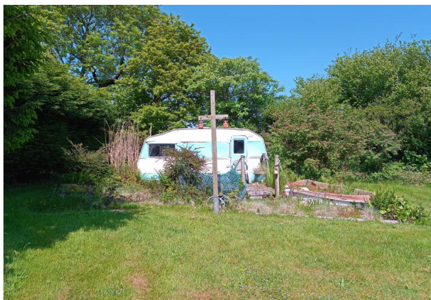
Gardens in May 2023