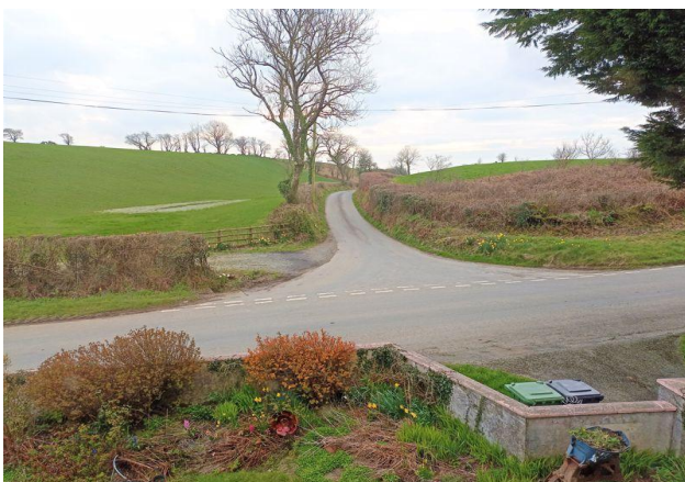
View From Bedroom 3