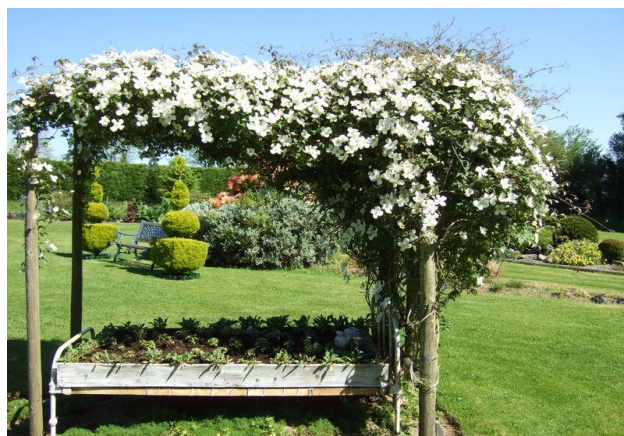
Old Summer Garden Image