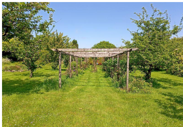
Gardens in May 2023