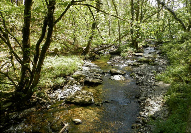
Lovely River Cych Nearby