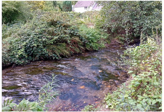
River Cych on Border