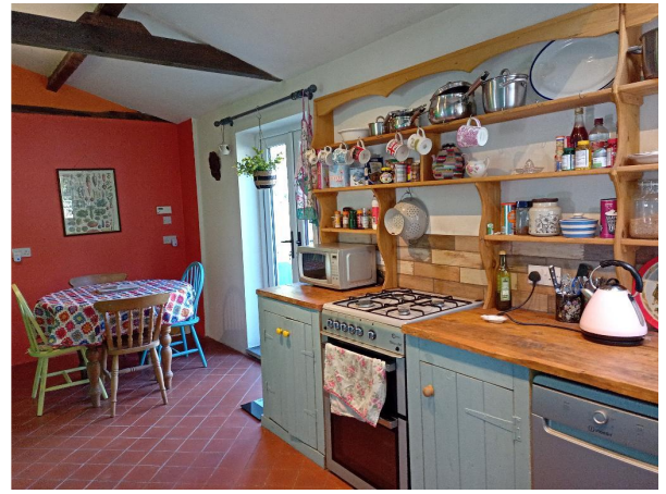
Kitchen / Diner - Another View