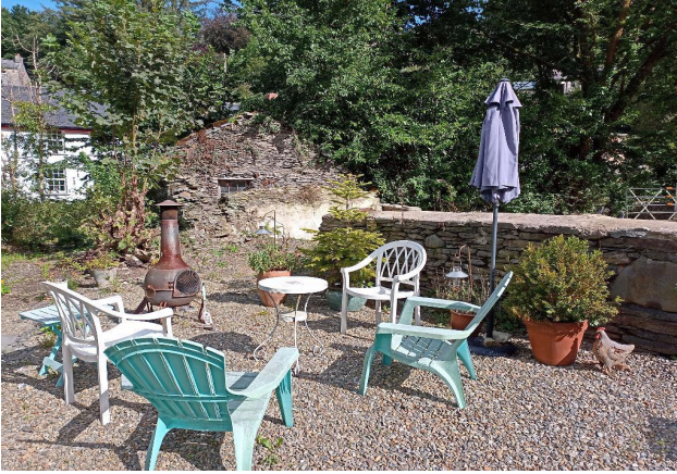
Rest and Relaxation