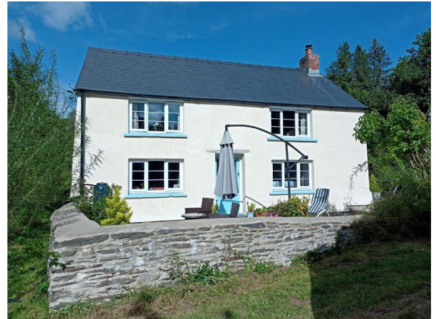
Another View of Property