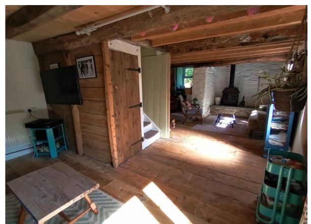
Lounge / Sitting Room - Another View