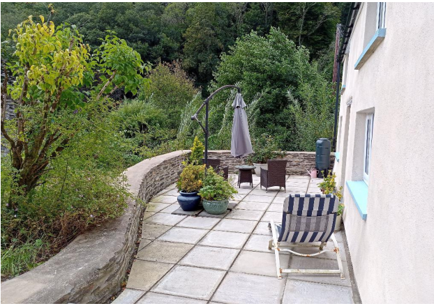
Sun Terrace - Another View