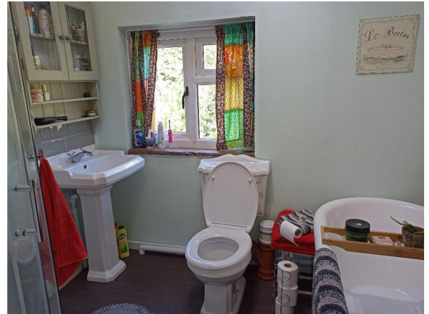
Bathroom with Roll Top Bath