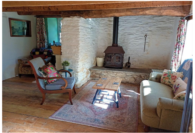
Sitting Area and Inglenook