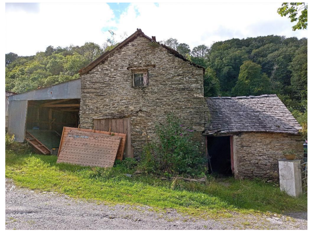
Old Mill with Potential

Directions - From the A484 in Newcastle Emlyn, take the turning towards the leisure centre/school sign-posted Capel Iwan. Proceed for several miles and you will wind your way down the valley to the river. Turn left and continue with the river to your right, past a few houses, over the bridge (not the 1st bridge but the second) and then turn left. Continue