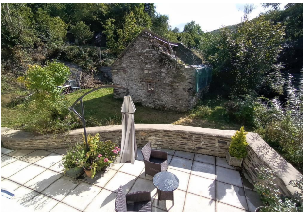
View From Bedroom 1