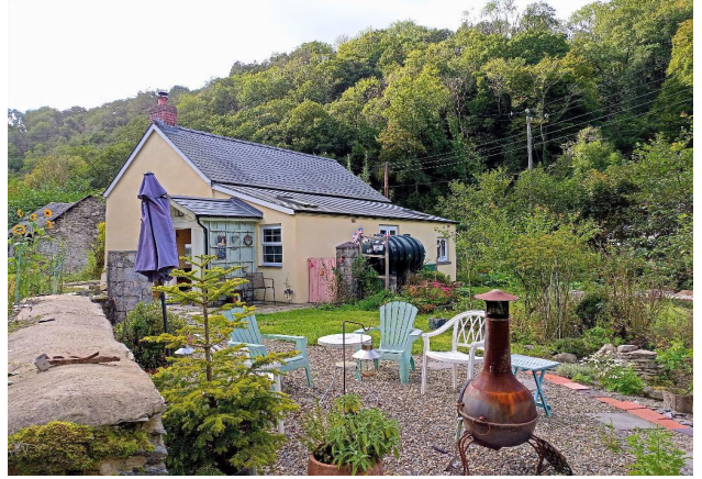
Another Main View