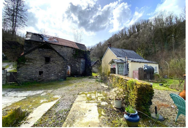
House & Large Outbuilding