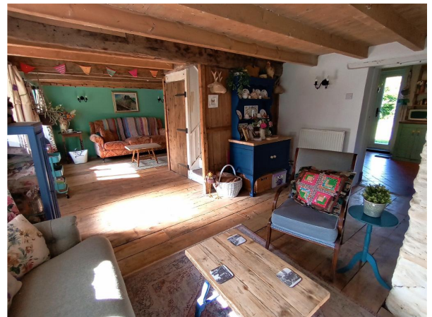
Lounge and Sitting Room