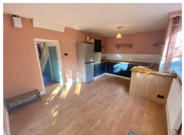
Kitchen / Diner