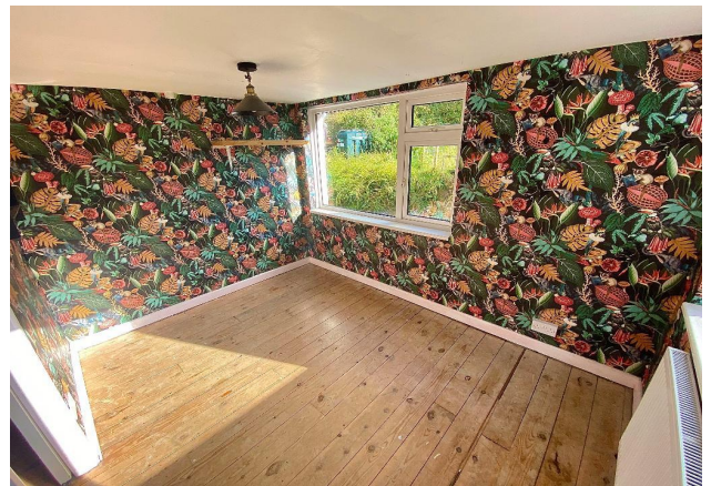
Bedroom 4 - Another View