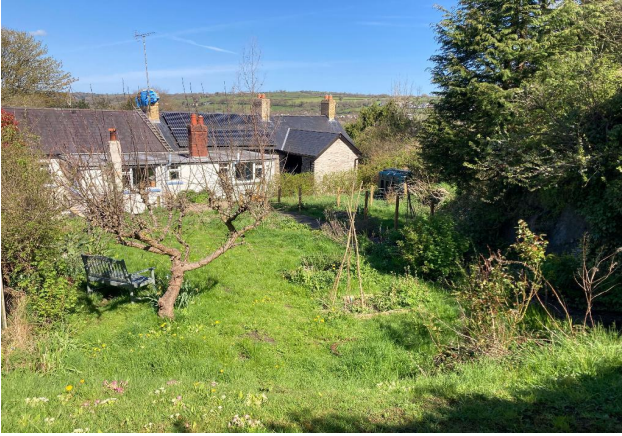
View of House from Rear Garden