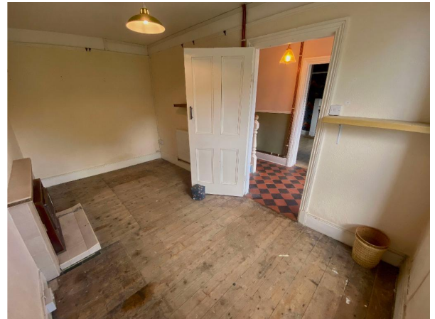
Sitting Room - Another View