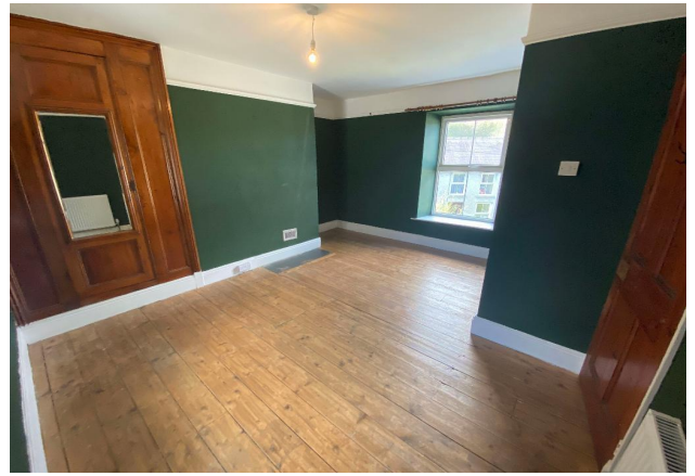
Bedroom 1 - Another View