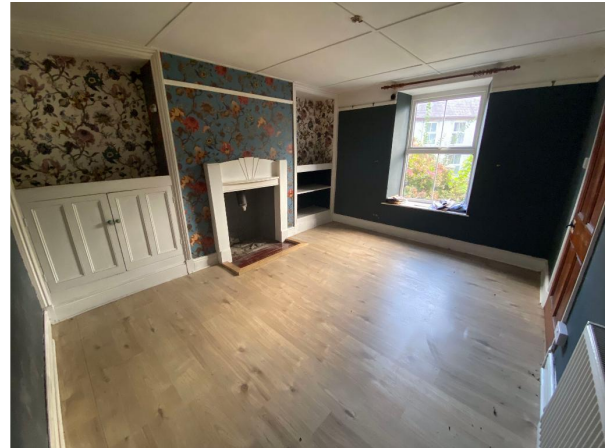
Lounge - Another View