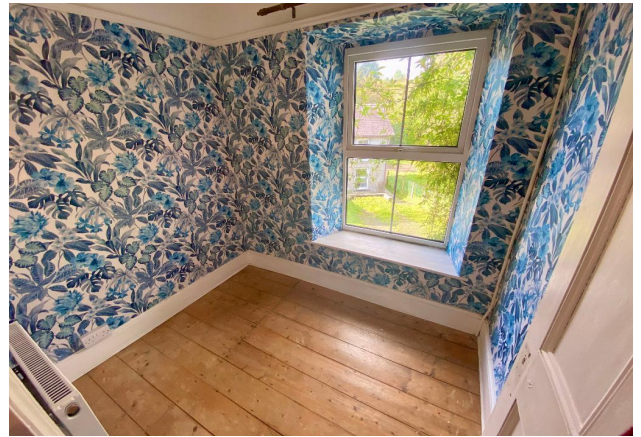
Bedroom 3 / Study