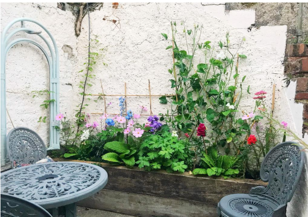
Patio Seating Area