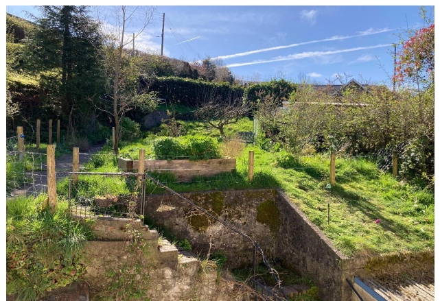
Rear Garden - Another View