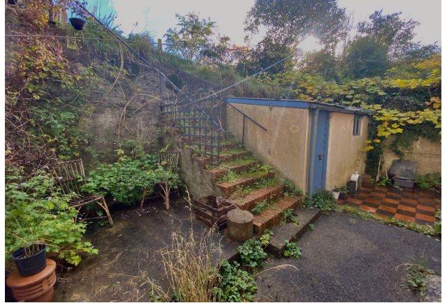
Steps To Rear Garden