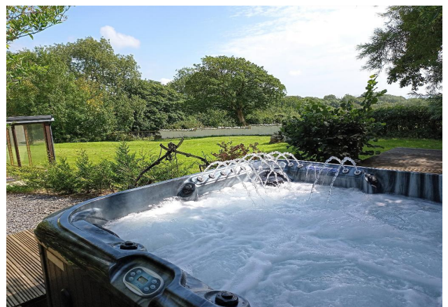
Superb Hot Tub (Included)