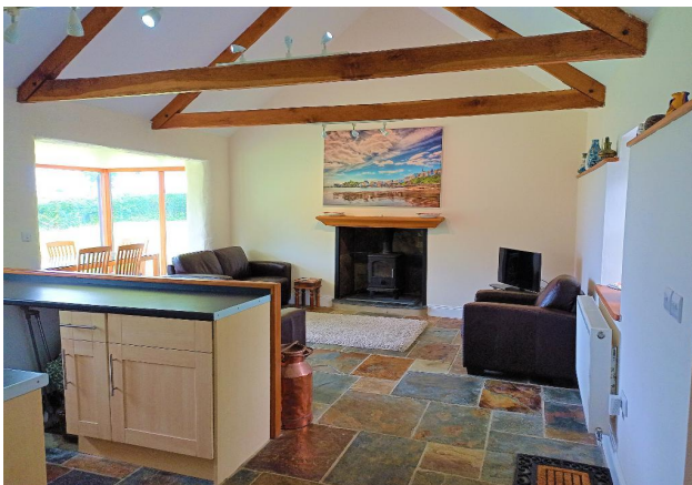
Open Plan Lounge/Kitchen/Diner