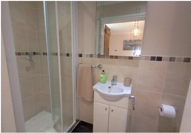
Bed 1 Ensuite