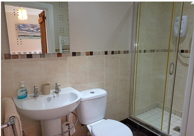
Bedroom 2 Ensuite