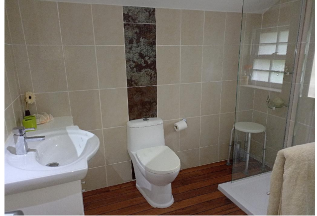
Bed 1 Ensuite