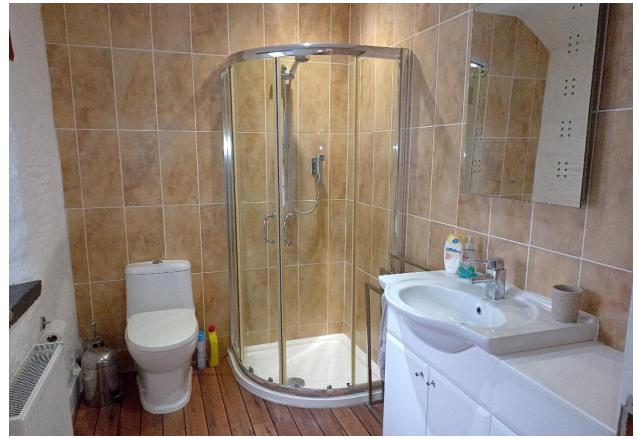
Family Shower Room