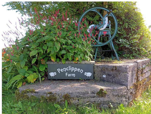
Entrance To Penclippen