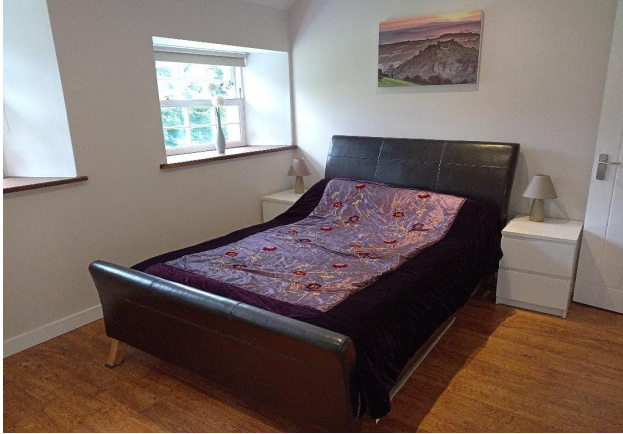
Bedroom 1 (ensuite)