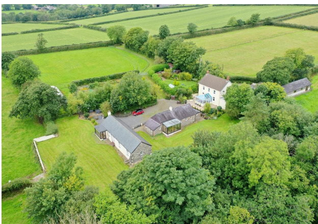
Aerial View 2