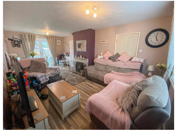
Lounge / Diner

turn onto the B4333 signposted Aberporth. On this road, take the first right hand turn into Derwen Gardens. At the T junction turn right and No. 77 is the right hand semi-detached house on the fourth block of semi's on the right, denoted by our for sale board.