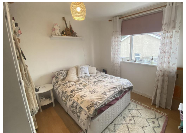
Bedroom 1 - Another View