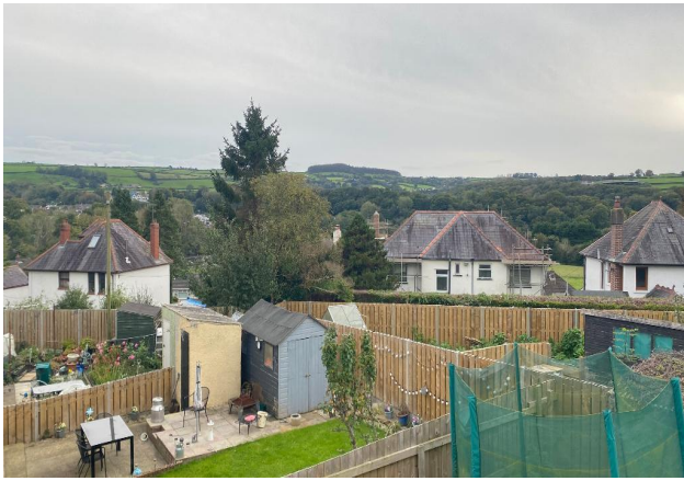
View From Bedroom 1