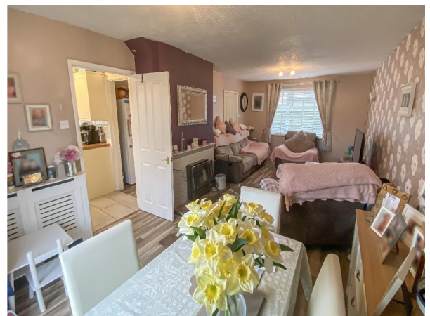
Lounge / Diner