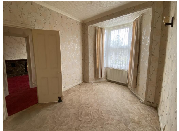
Sitting Room / Bedroom 4