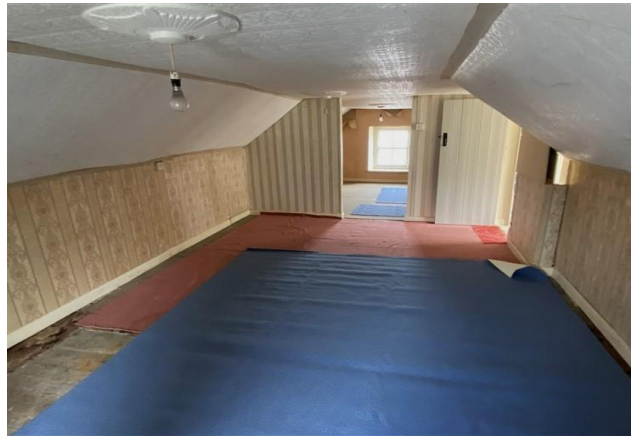
Attic Room - Another View