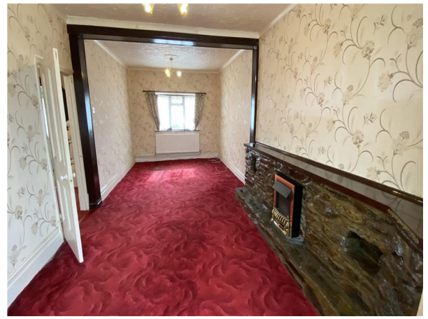
Lounge - Another View

Manager's Note - Please note: We have been advised by our client's