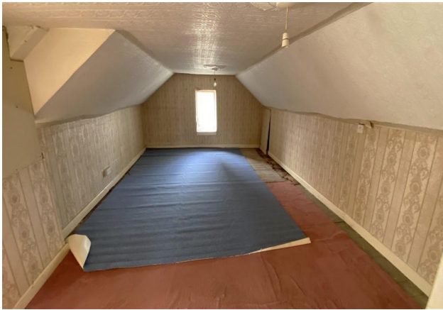
Attic Room - Another View