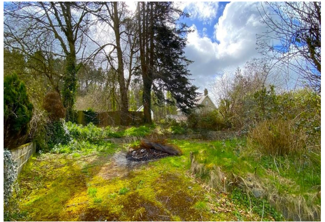
Rear Garden Parking Area