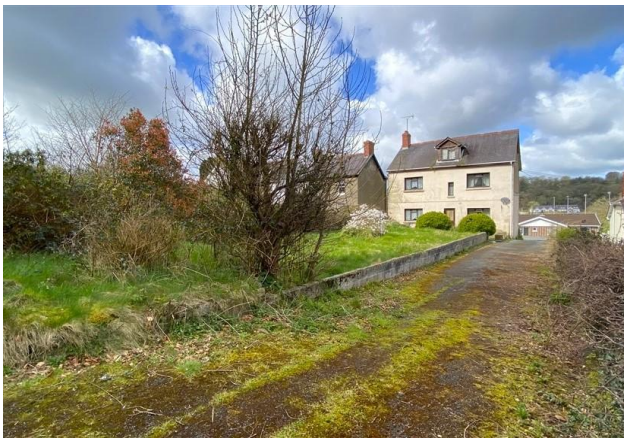
Rear Of House With Driveway