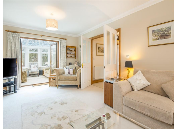
Lounge Another View