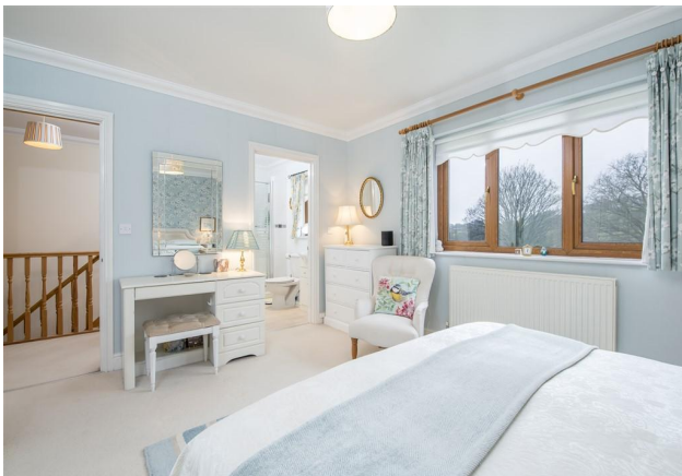
Master Bedroom Another View