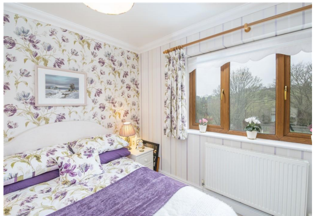
Bedroom 3 Another View