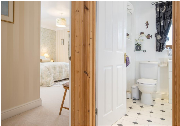
Bedroom 2 & Family Bathroom