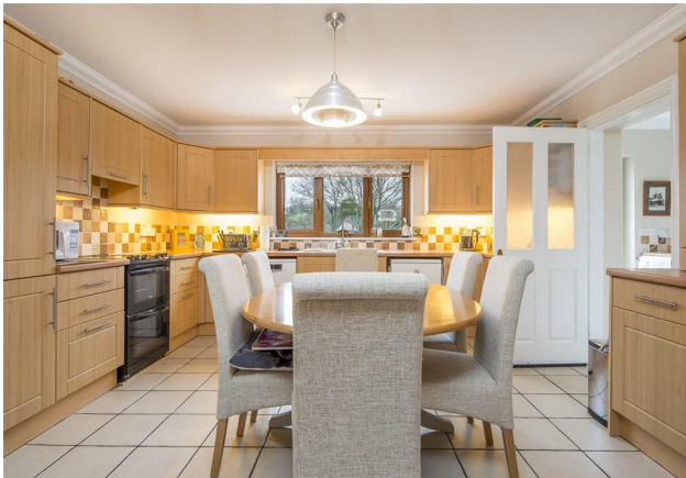
Kitchen / Breakfast Room