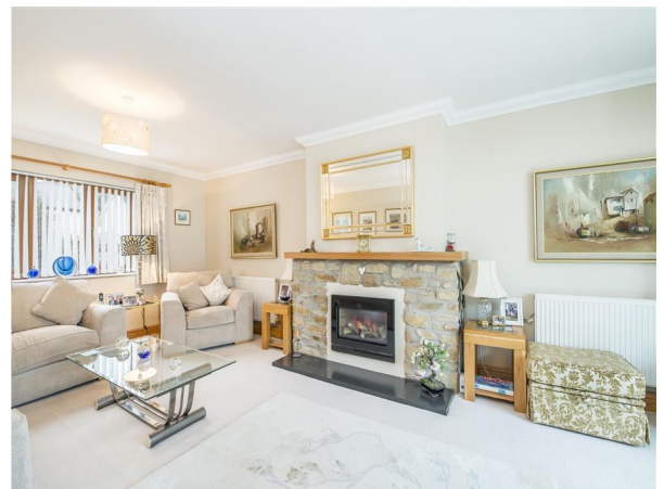
Lounge Another View