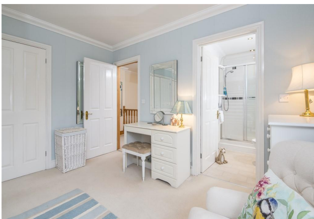
Master Bedroom & En-Suite