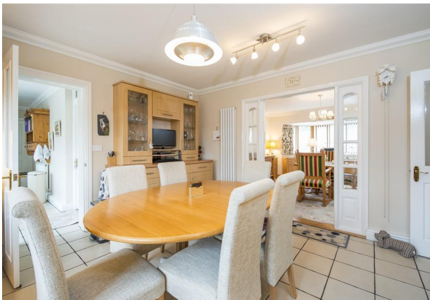
Kitchen / Breakfast Room