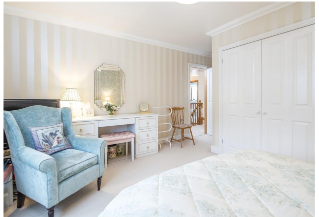
Bedroom 2 Another View