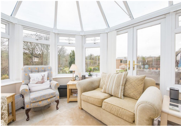
Conservatory Another View