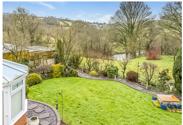
View From Master Bedroom