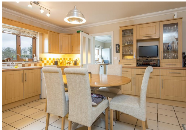
Kitchen / Breakfast Room