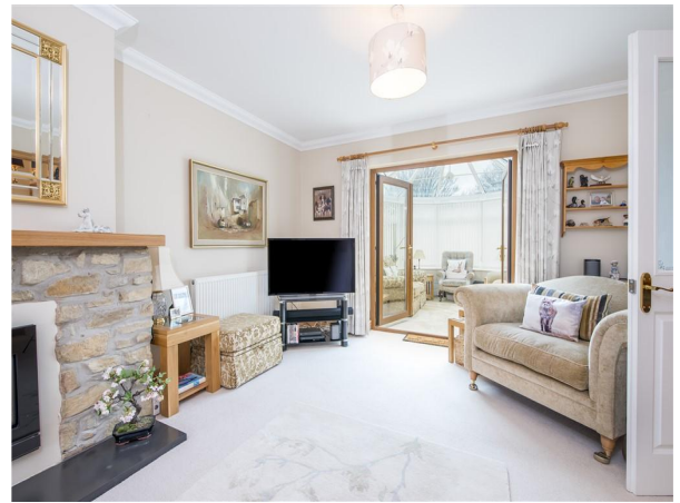
Lounge Another View

Directions - From Newcastle Emlyn, take the A475 Lampeter road. At the staggered cross roads in Horeb, go straight across and proceed to Rhydowen. Turn left at the cross roads immediately after the antiques onto the B4459 towards Talgarreg and Synod Inn and continue for approx. 350 yards where you will find Oakfield House on the left. Google co-ordinates: 52.08579689200191, -4.273755345543314 What3Words: ///proven.stop.upholding