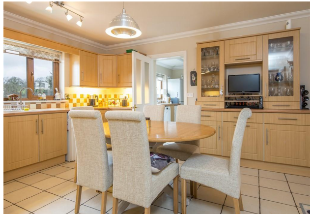
Kitchen / Breakfast Room