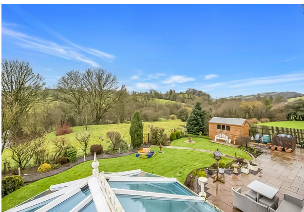
View From Bedroom 3