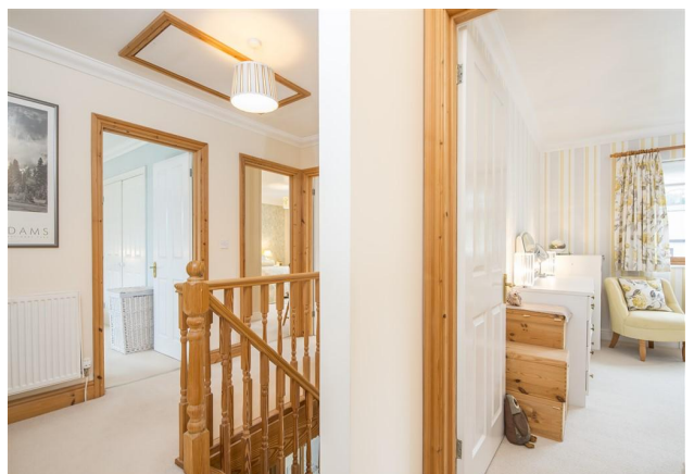
Landing Area & Bedroom 4