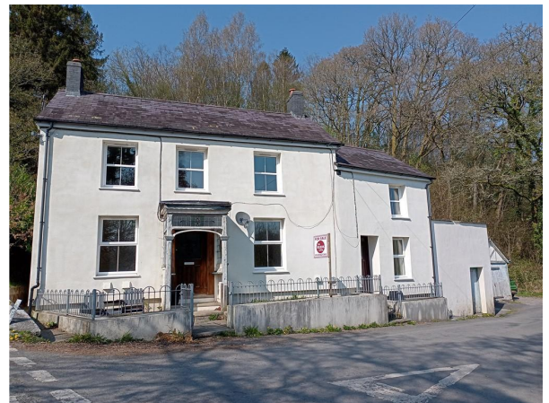
Close Up Main View