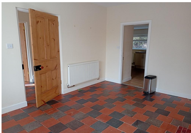
Troedyrhiw 1 - Dining Room