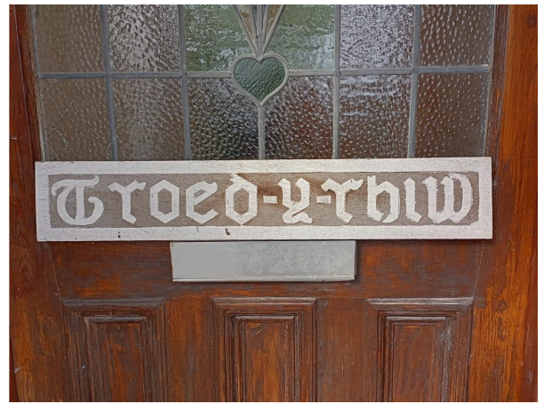
Troed y Rhiw

What3words: ///lighter.trailers.blockage