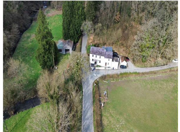
Aerial View 1