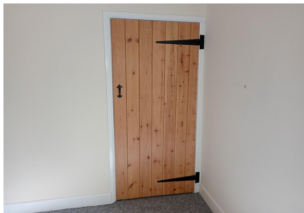
Access (if req) to No 2