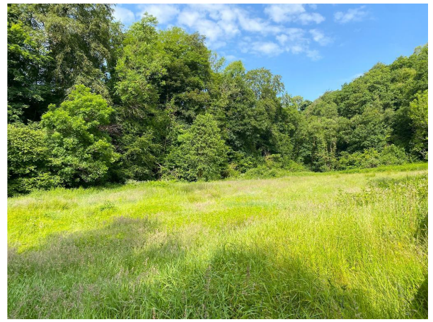
Paddock Next To River

2 Troedyrhiw - First Floor - Accessed via staircase in kitchen/diner and giving access to: