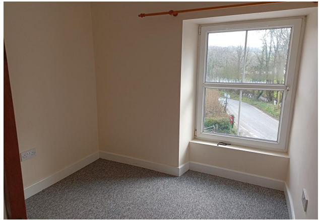
Troedyrhiw 1 - Bedroom 2