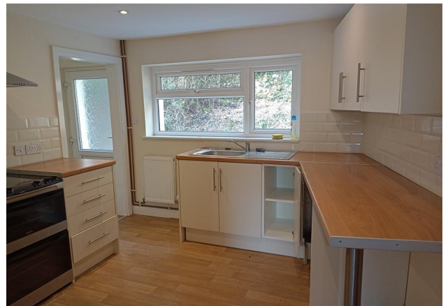
Troedyrhiw 1 - Kitchen