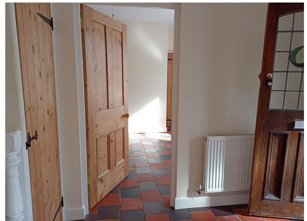
Troedyrhiw 1 - Hallway