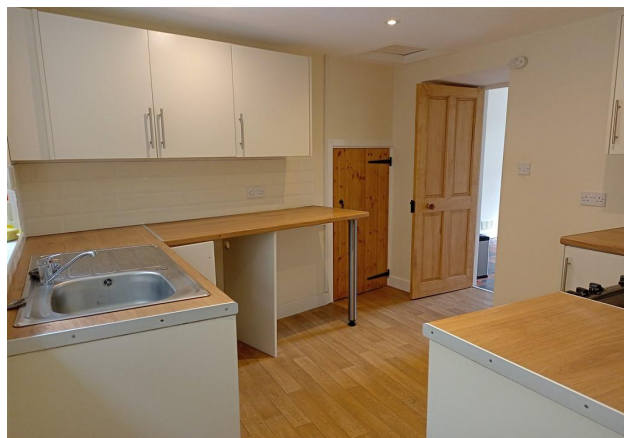
No 1 Kitchen -Other View