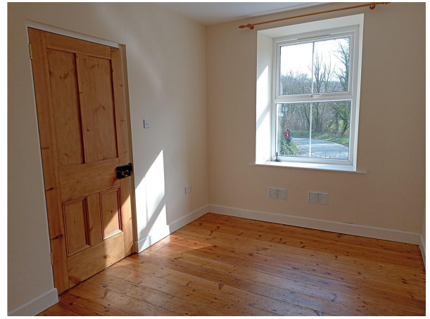
Troedyrhiw 1 - Lounge

What3words: ///lighter.trailers.blockage