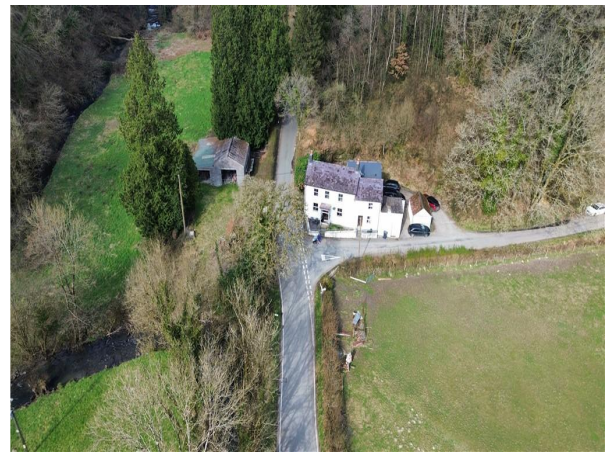
Aerial View 1

2 Troedyrhiw - First Floor - Accessed via staircase in kitchen/diner and giving access to: