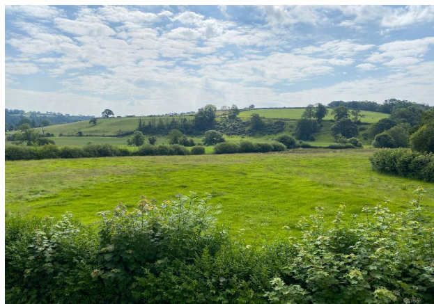
View From Number 2 Master Bedroom