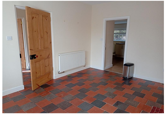
Troedyrhiw 1 - Dining Room