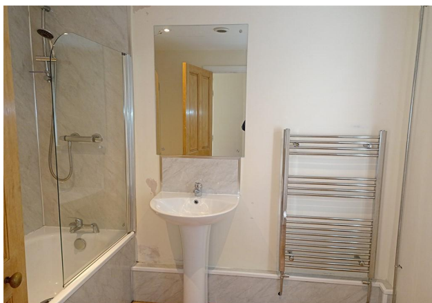
Troedyrhiw 1 - Bathroom