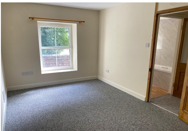
Troed Y Rhiw 2 - Bedroom 2