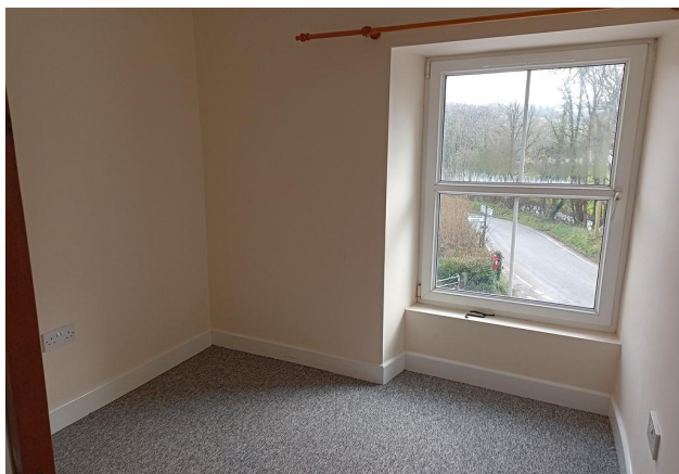
Troedyrhiw 1 - Bedroom 2