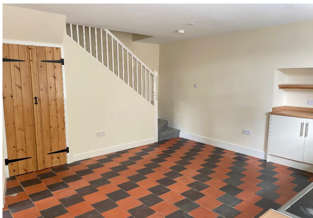
Troed Y Rhiw 2 - Kitchen / Diner