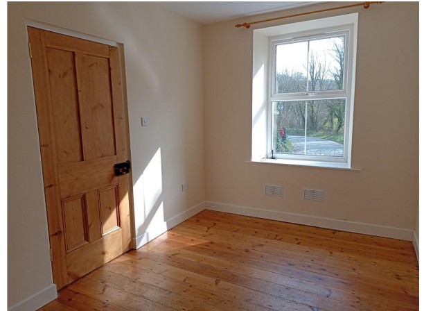
Troedyrhiw 1 - Lounge