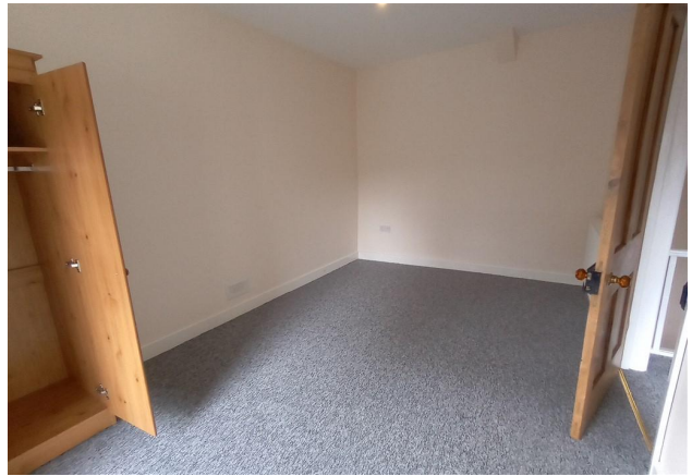
Troedyrhiw 1 - Bedroom 1