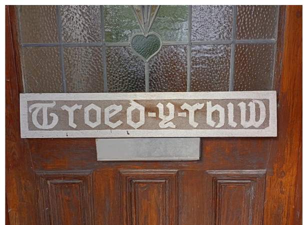
Troed y Rhiw