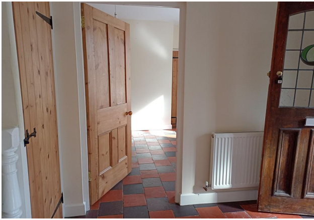
Troedyrhiw 1 - Hallway