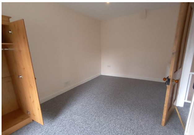
Troedyrhiw 1 - Bedroom 1