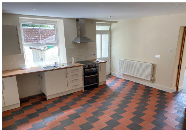
Troed Y Rhiw 2 - Kitchen / Diner