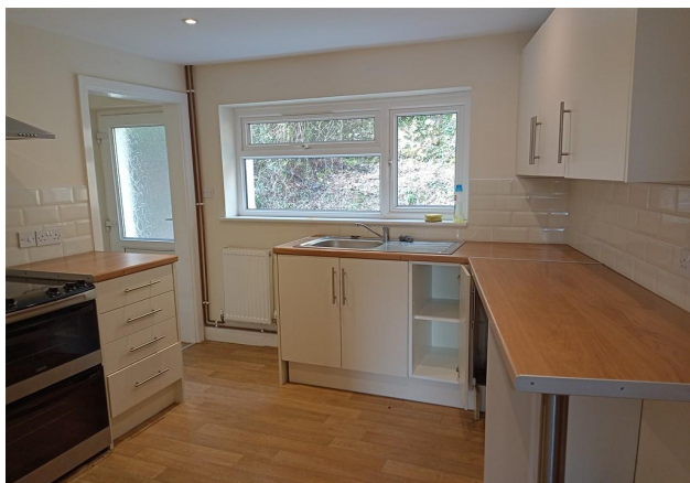
Troedyrhiw 1 - Kitchen