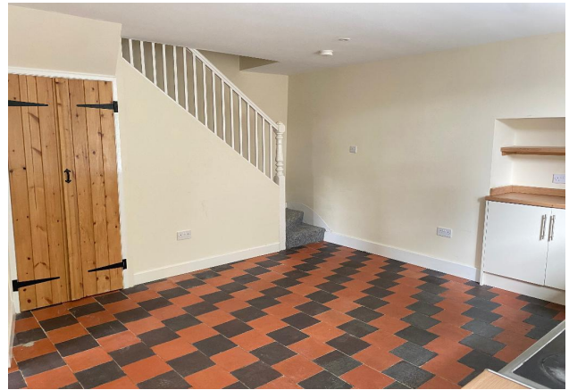
Troed Y Rhiw 2 - Kitchen / Diner