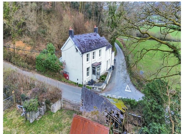
Aerial View 2