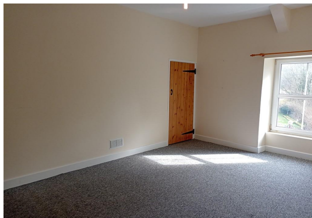
Troedyrhiw 1 - Bedroom 3