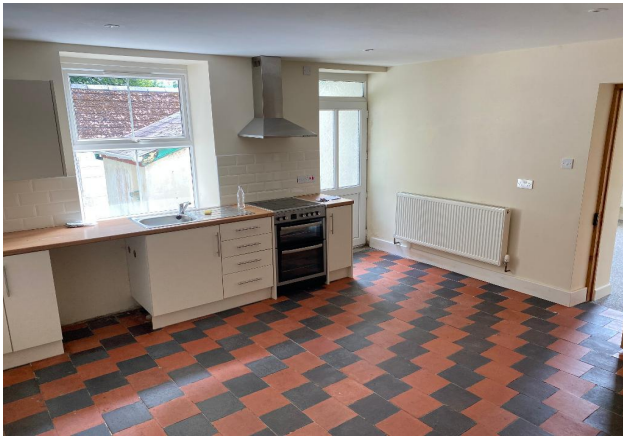
Troed Y Rhiw 2 - Kitchen / Diner