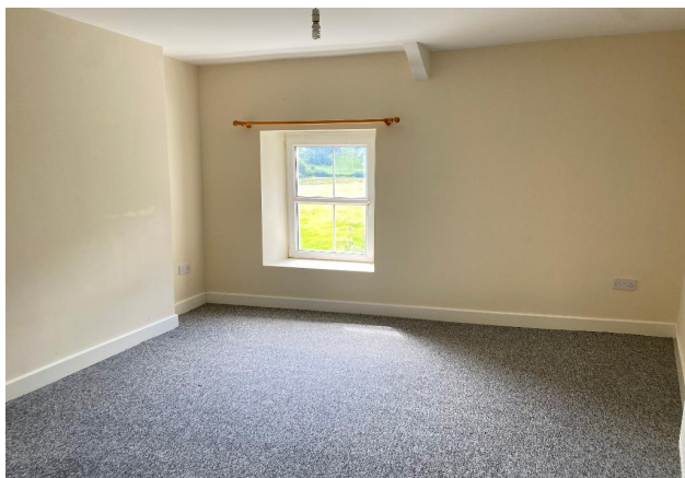
Troed Y Rhiw 2 - Master Bedroom