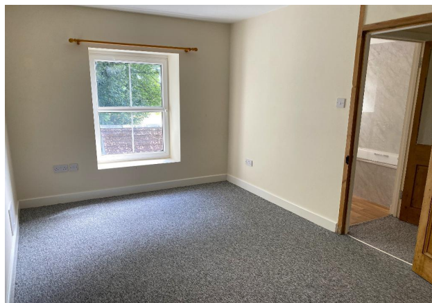
Troed Y Rhiw 2 - Bedroom 2