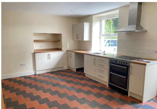
Troed Y Rhiw 2 - Kitchen / Diner