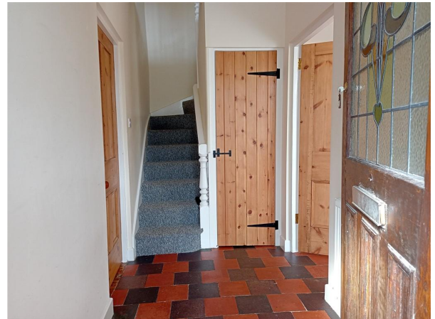
Troedyrhiw 1 - Hallway