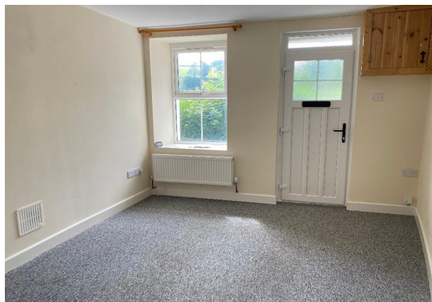
Troed Y Rhiw 2 - Lounge