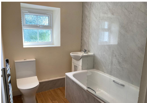
Troed Y Rhiw 2 - Bathroom