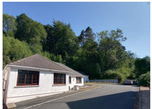
Main View Showing Cul De Sac Position