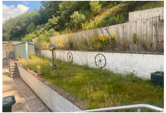
Garden Area to Rear