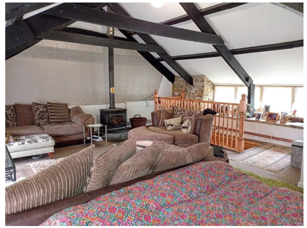
Large Vaulted Lounge

To the rear of the property there is a large decked area together with lawned gardens with an open outlook over farmland. Please note : our client is in the process of arranging for a doorway to be installed from the first floor landing area straight out onto the decked area and gardens as this would provide for a better rear access arrangement. This will be completed before exchange of contracts. Please discuss with our client