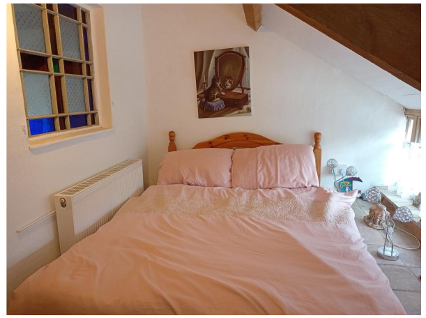
First Floor Bedroom

Google Co-ordinates: 51.904069590300985, -4.660105229754421