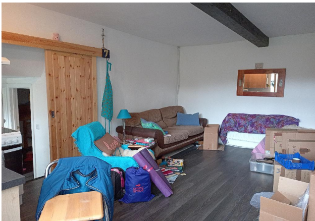
Potential Annex Lounge