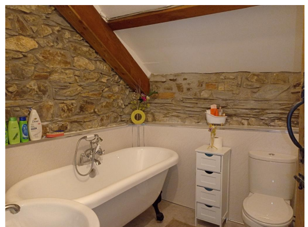
Bathroom (1 of 3)