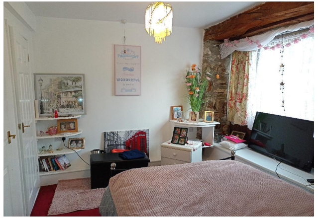
Downstairs Ensuite Bedroom