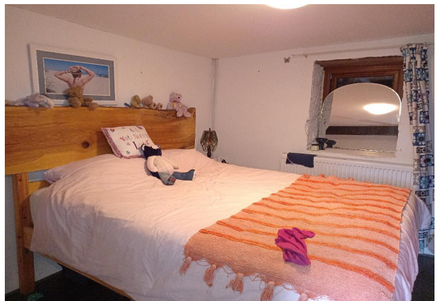
Potential Annex Bedroom