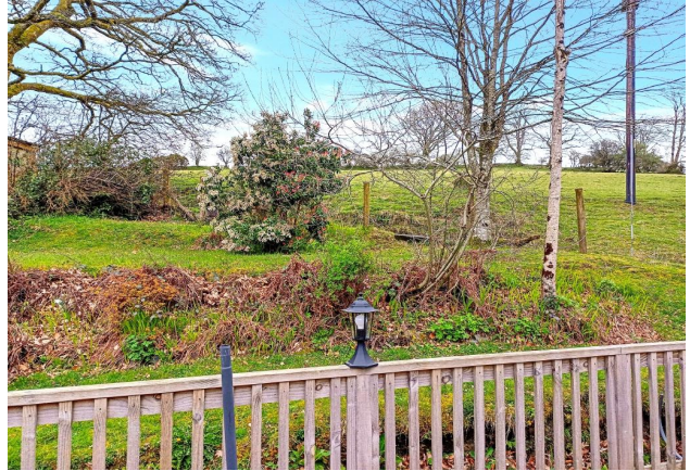
Rear Gardens With Open Outlook