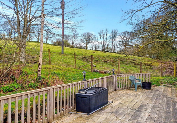
Rear Decking And Gardens