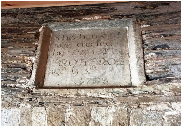
Plaque Showing Built In The 18thC