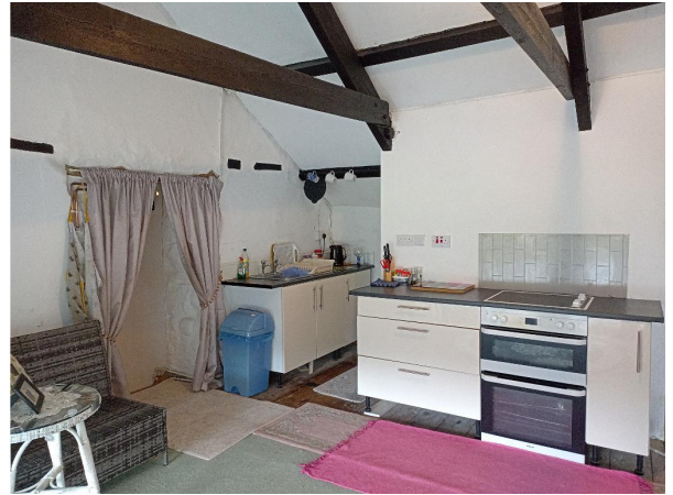
Kitchen / Diner