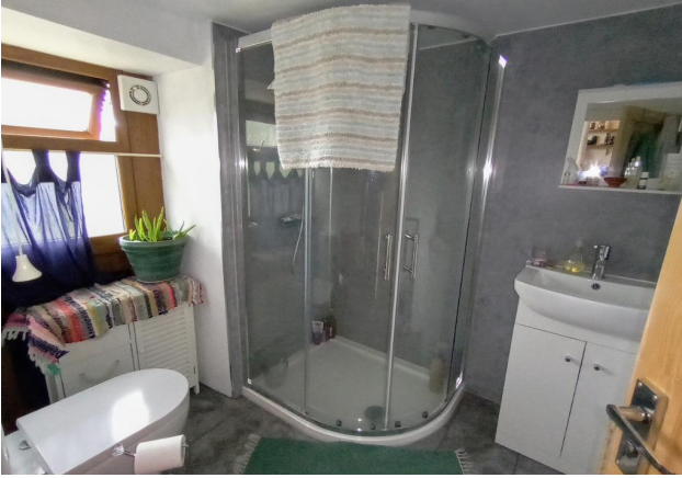
Potential Annex Shower Room