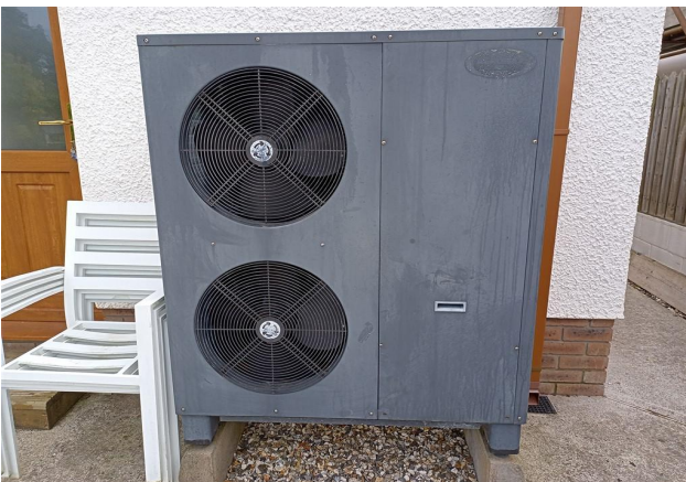
Air Source Heat Pump