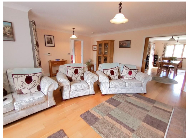
Lounge -Another View