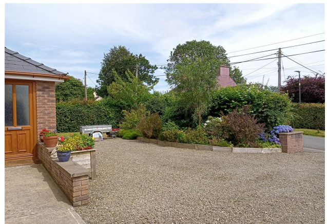
Front Gardens & Driveway