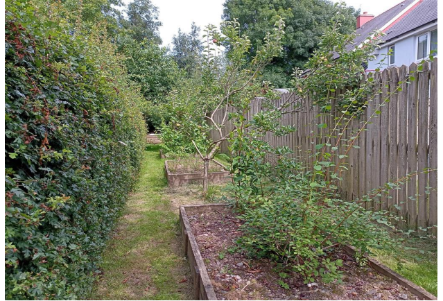
Extra Piece Of Garden