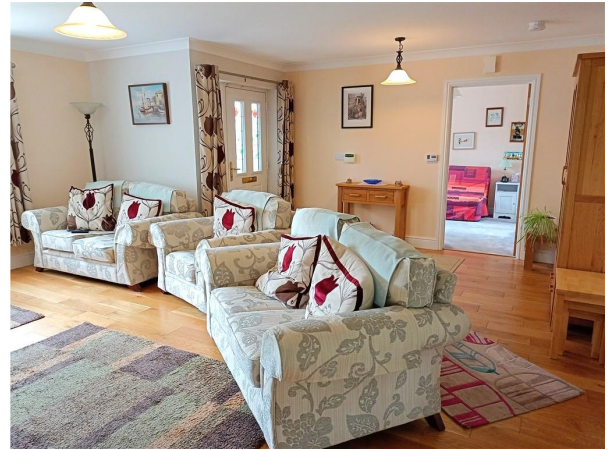
Lounge Another View