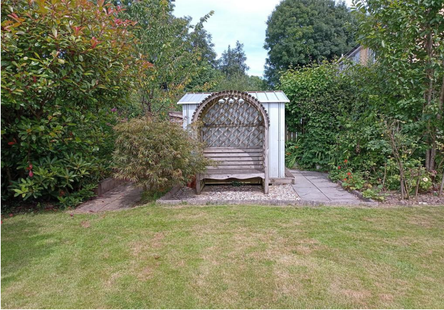
Well Tended Gardens