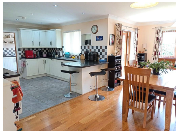
Open Plan Kitchen / Diner