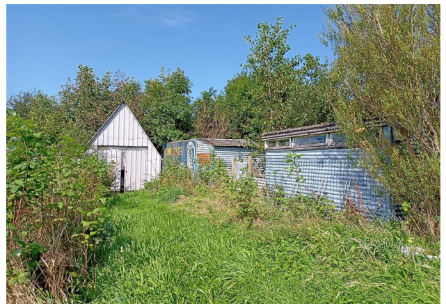
Garage And Other Outbuildings