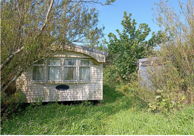
The Original Mobile Home