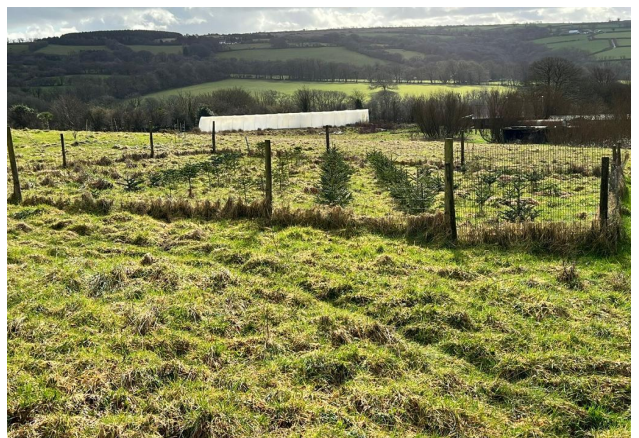
Polytunnel and Views