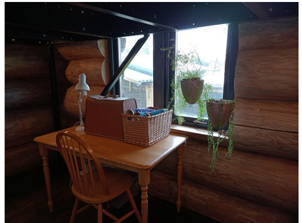
Bedroom 2 / Hobby Room