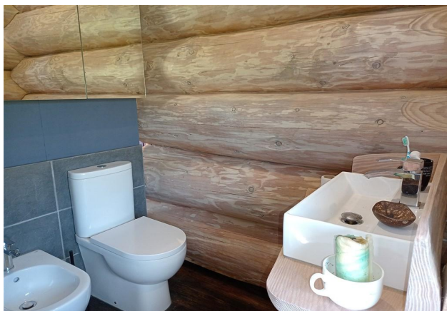
Shower Room - View 1