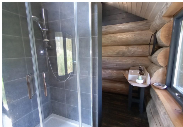
Shower Room - View 2