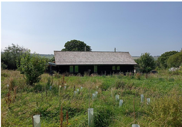
Rear View Of Cabin