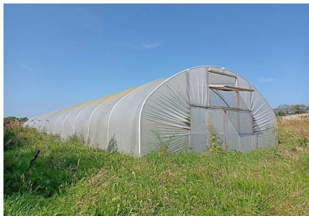
The Huge Polytunnel -View 2