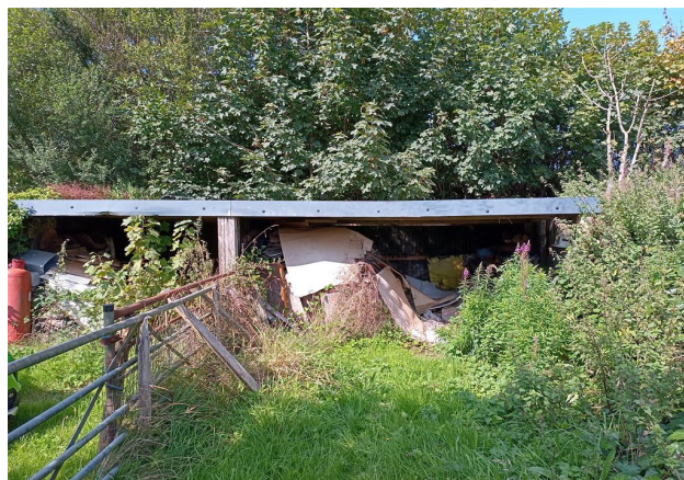
Outbuilding-Previously The Garage