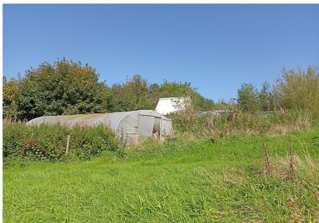
The Small Polytunnel