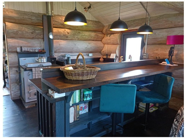
The Kitchen Area