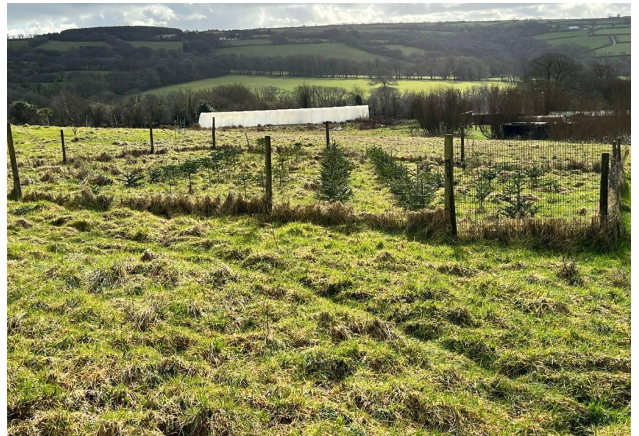
Polytunnel and Views