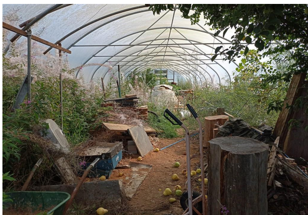
Inside View Of Huge Polytunnel