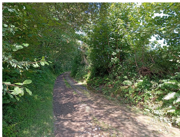
Shared Stone Track To Holding

Planning Consents - This site had planning for a mobile home and our client has since many years ago replaced the mobile home with what you