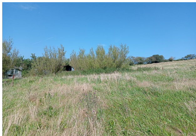
Land, Willow & Outbuildings