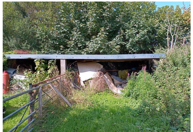
Outbuilding-Previously The Garage