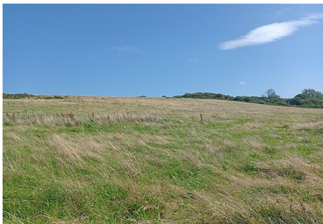
The Top Field