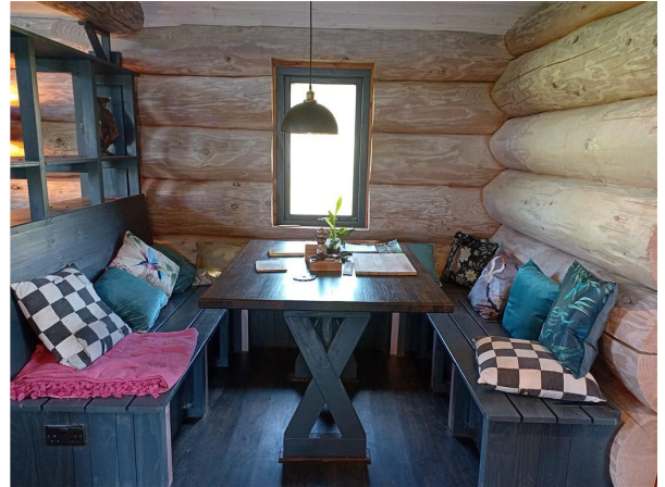
The Dining Area