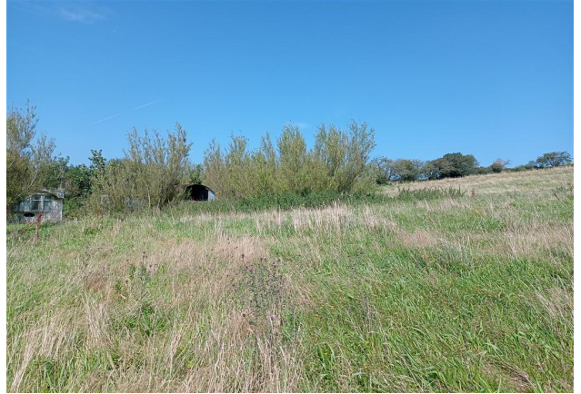
Land, Willow & Outbuildings