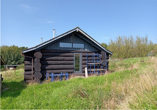
Gable End View Of Cabin