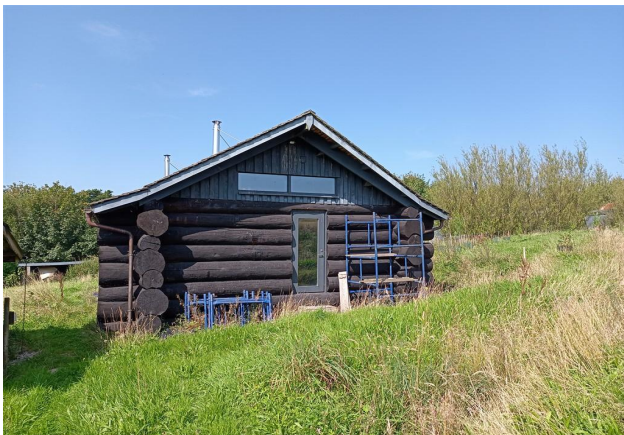
Gable End View Of Cabin