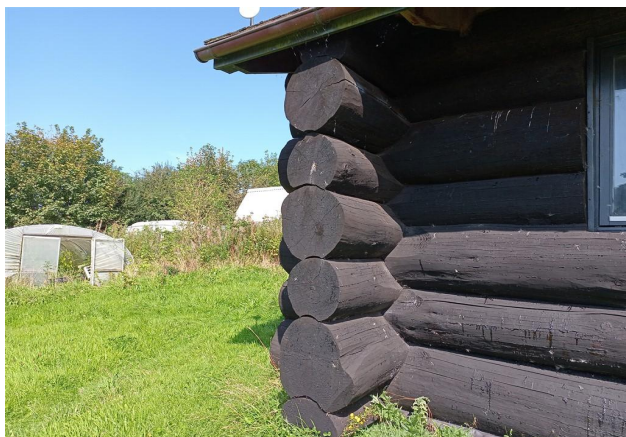
Solid Construction !