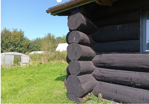
Solid Construction !