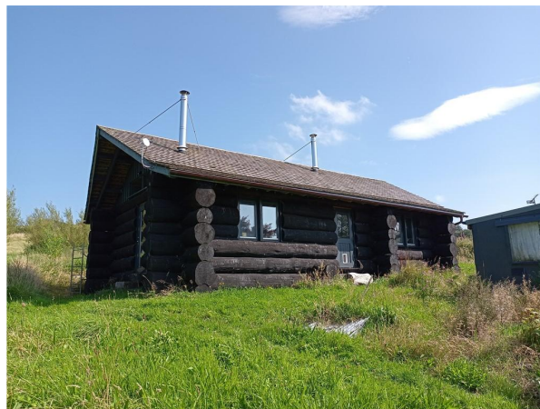
Main View 1