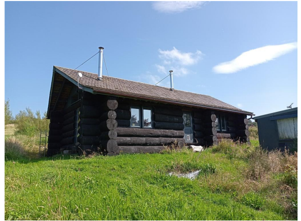
Main View 1