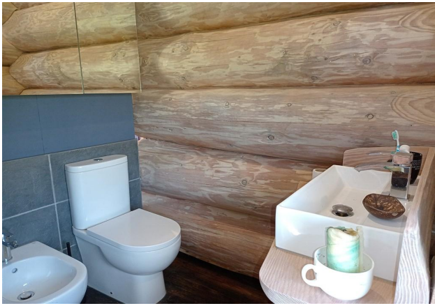
Shower Room - View 1