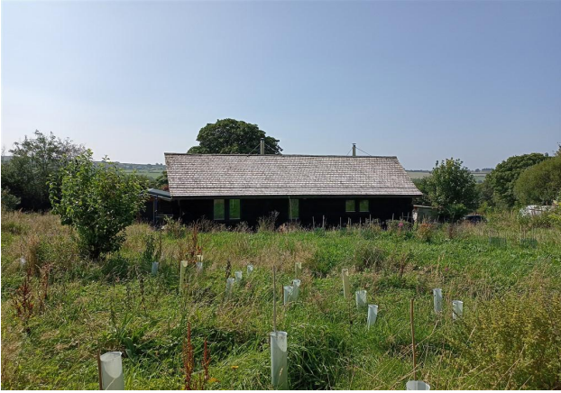
Rear View Of Cabin