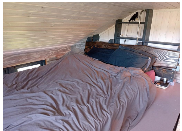
Attic Room -Used As Bedroom