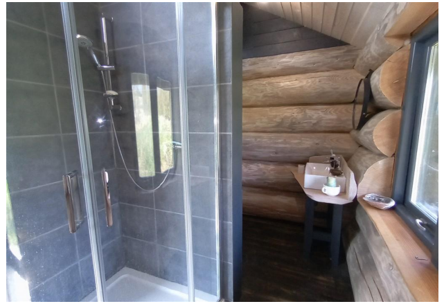
Shower Room - View 2