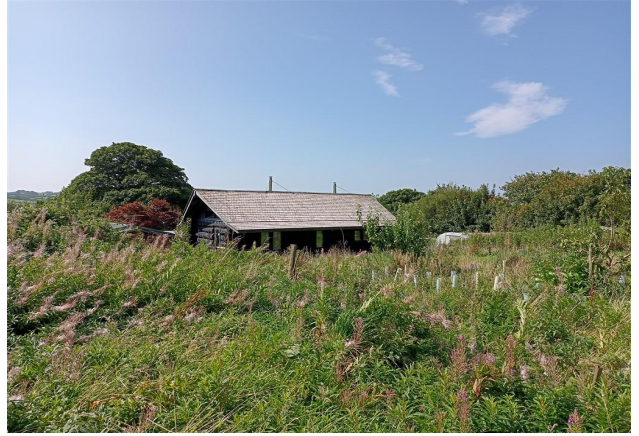
Rear View Of Cabin