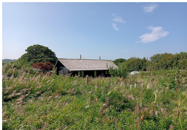
Rear View Of Cabin