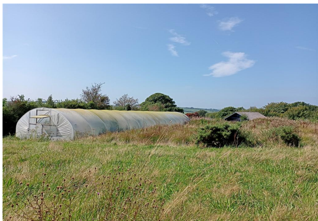
The Huge Polytunnel