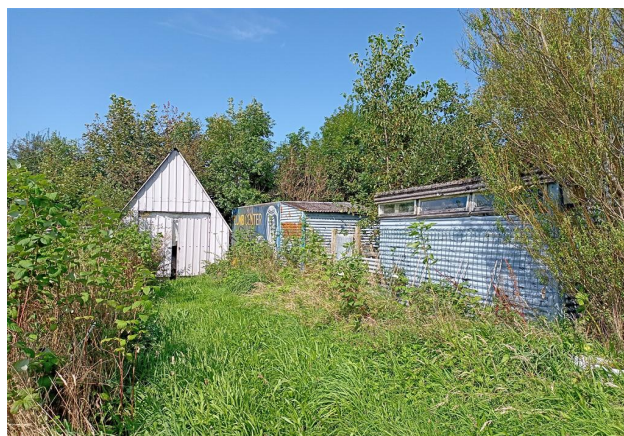
Garage And Other Outbuildings