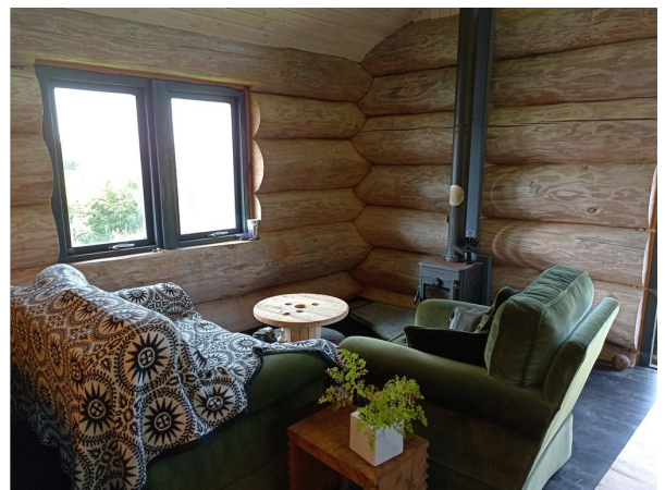
Sitting Room Area & Logburner