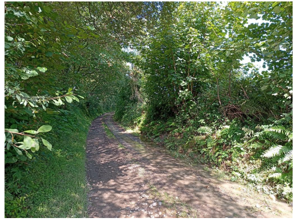
Shared Stone Track To Holding

Planning Consents - This site had planning for a mobile home and our client has since many years ago replaced the mobile home with what you