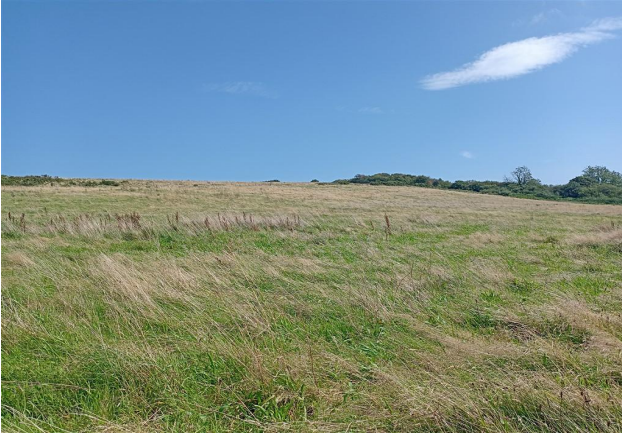
The Top Field