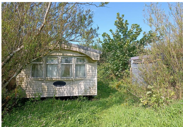
The Original Mobile Home