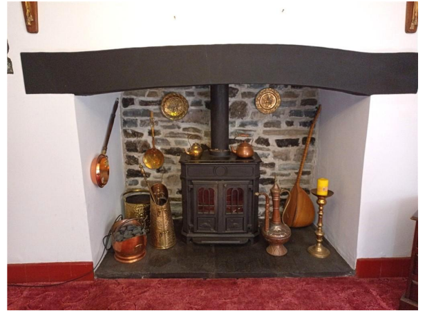
Lovely Inglenook Fireplace