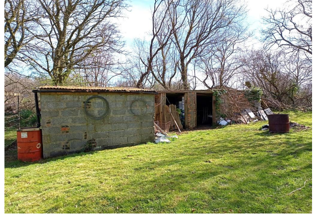
Useful Storage Shed