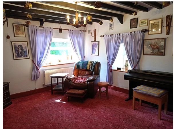
Lounge - Another View