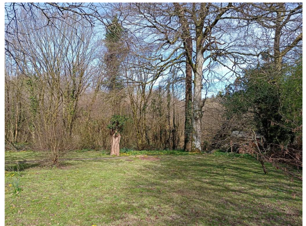
Large Gardens & Wooded Backdrop