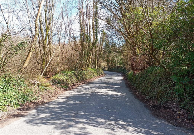
Quiet Road Past The Property