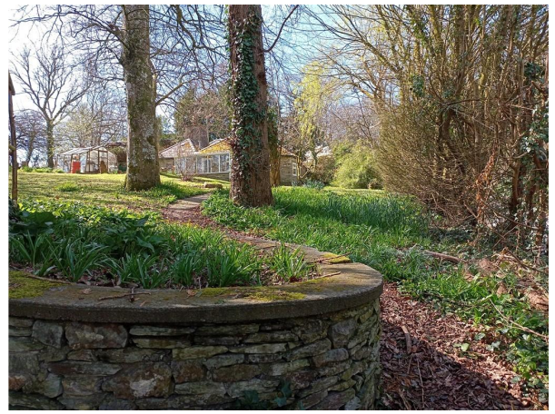
Main View & Gardens

Directions - From Newcastle Emlyn take the B4333 Aberporth road and then when you reach Cwm Cou, take the left turn onto the B4570 and continue to Ponthirwaun. Continue through the village and at the top of the hill in Neuadd Cross turn right towards Beulah. Continue along here for 0.3 of a mile and this bungalow is on the right hand side, third