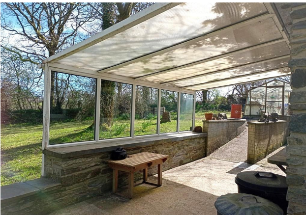
Lean to Conservatory