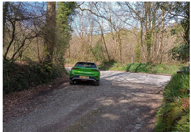
Parking Space For 1 Car