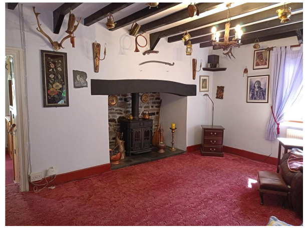
Character Lounge And Inglenook