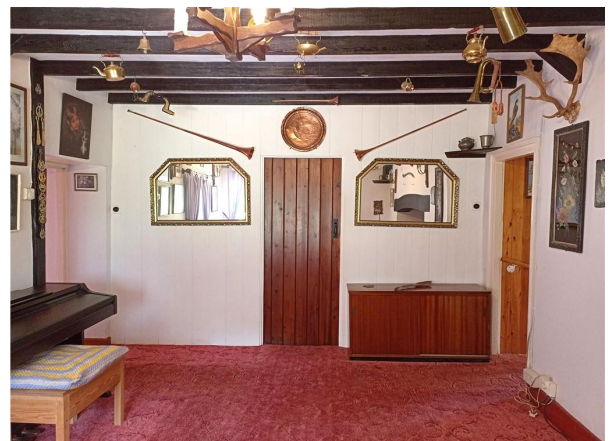
Lounge - Another View