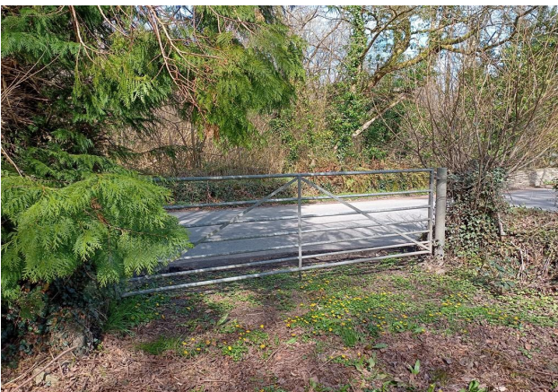
Second Access Point/Parking Area