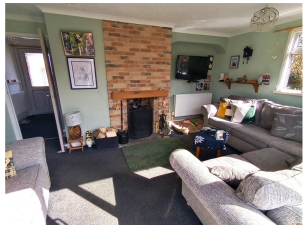
Lounge - Another View