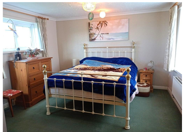
Master Bedroom 3