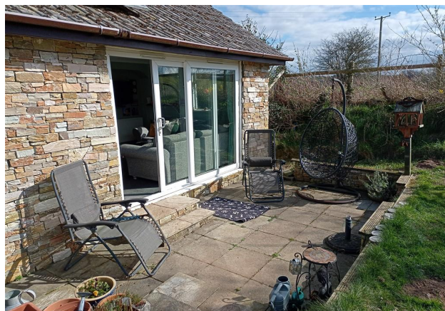
Rear Patio Area