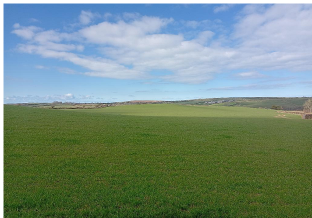
Views From Master Bedroom