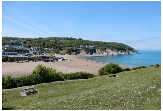
Aberporth Beach Just Under 4 Miles Away