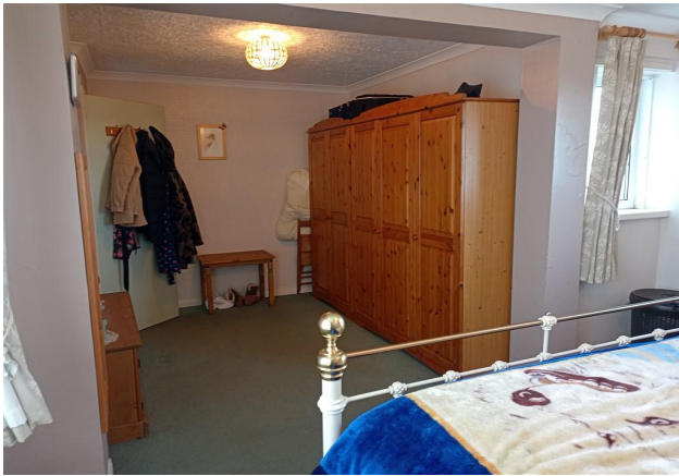
Other View Of Master