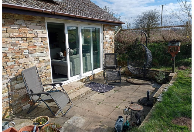
Rear Patio Area