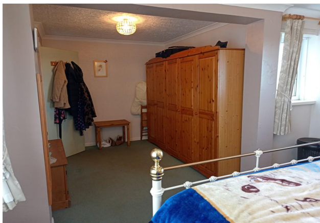
Other View Of Master