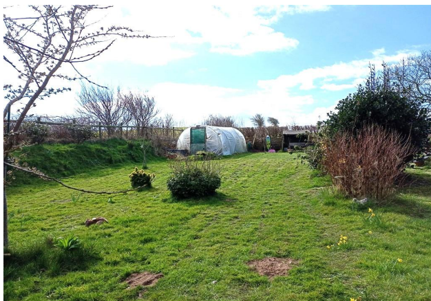
Large Rear Gardens