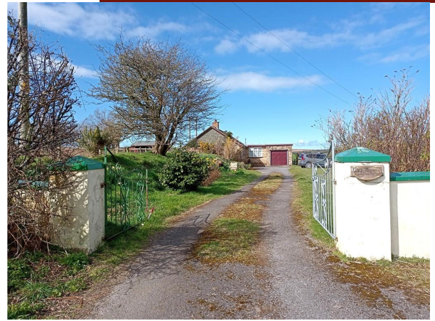
As You Arrive ...

Google Co-ordinates: 52.10601657241294, -4.619338522534584