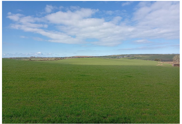
Views From Master Bedroom