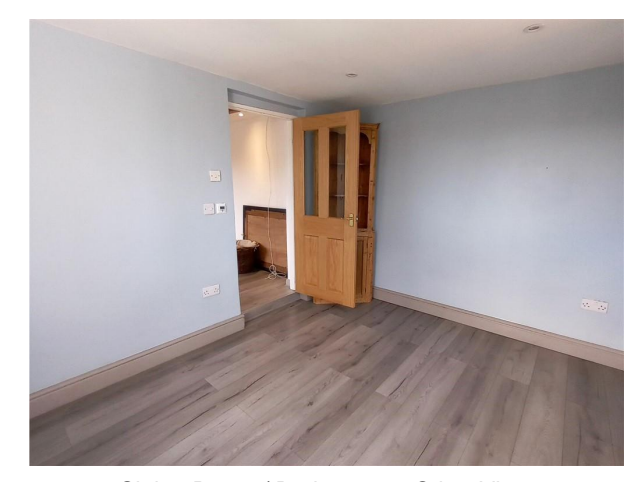
Sitting Room / Bedroom 4 - Other View

Directions - From Newcastle Emlyn, proceed over the river bridge and take the A475 Lampeter road. Proceed through Llandyriog and on towards Aberbanc. The property is on the left at the top of the steep hill on the approach to Aberbanc, denoted by our For Sale board.