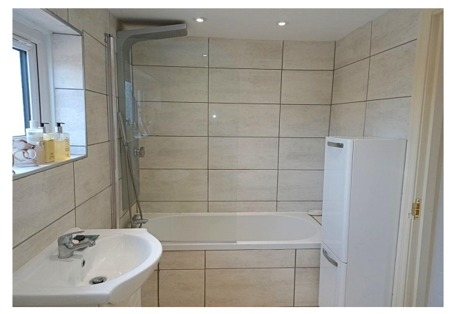
Bathroom - Another View