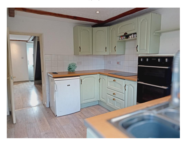
Kitchen - Another View