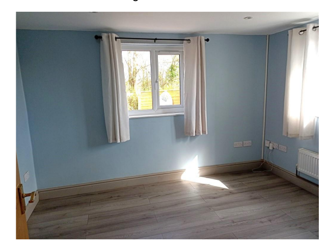
Sitting Room / Bedroom 4