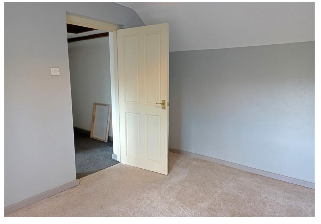
Bedroom 3 - Another View