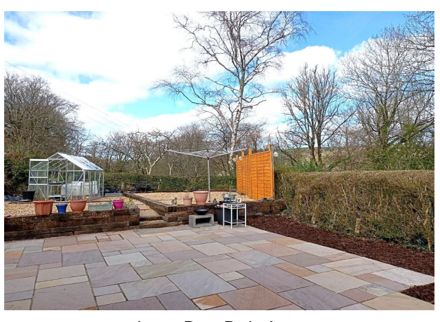
Large Rear Patio Area