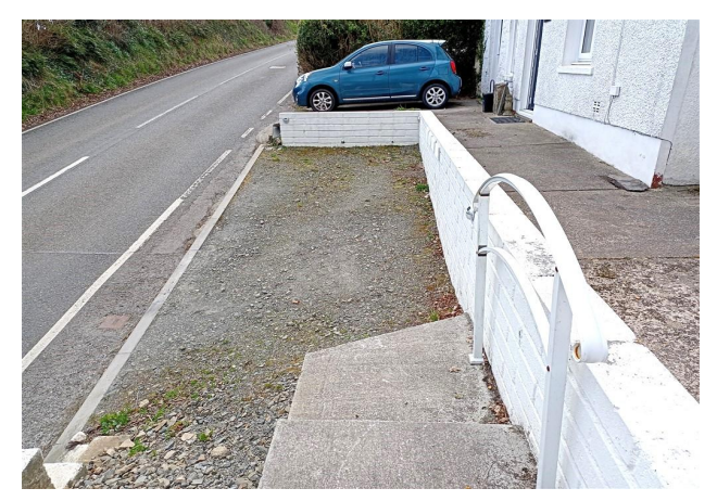
Off Street Parking For 1 Car