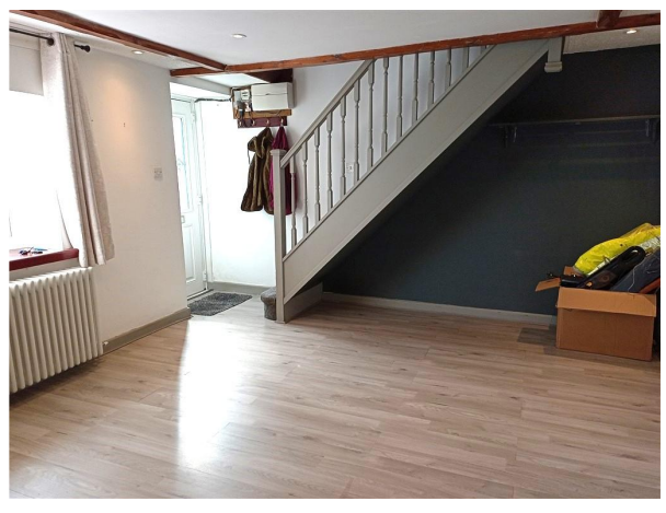
Lounge - Another View