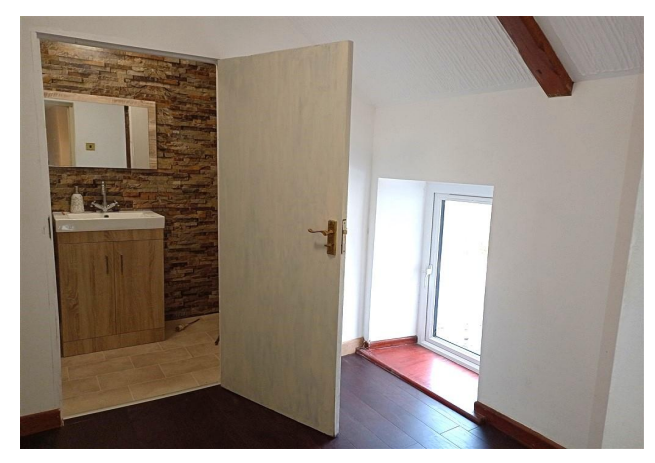
Small Bedroom With Ensuite WC