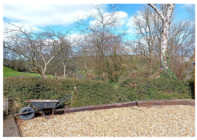
Views To Rear