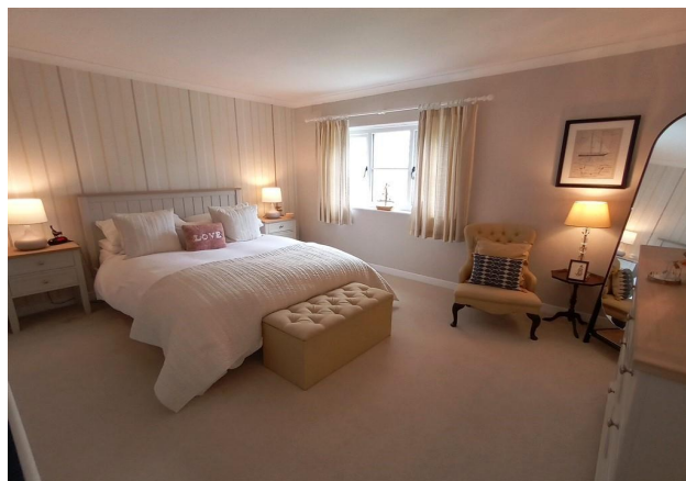
Master Bedroom 1