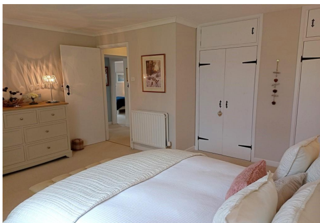
Other View Of Master Bedroom