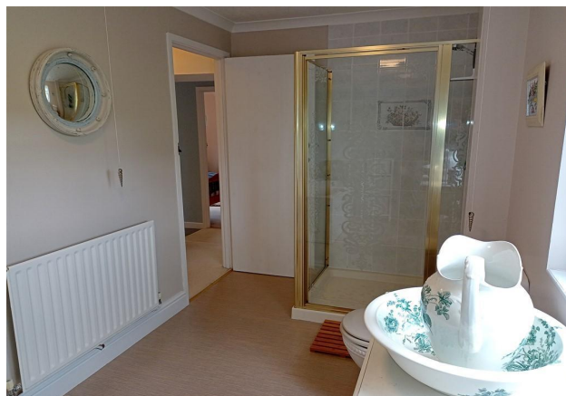
Bathroom - View 2