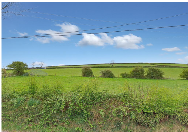
View Over Fields From Bathroom