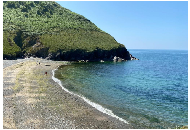
1.5 Miles To Cwmttydi Beach