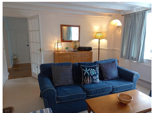
Other View Of Lounge