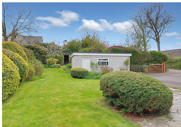
Gardens And Garage