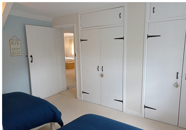
Other View Of Bedroom 2