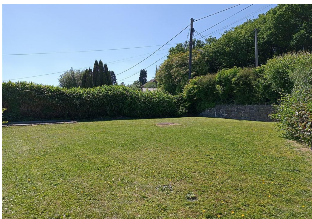
Front Lawned Gardens