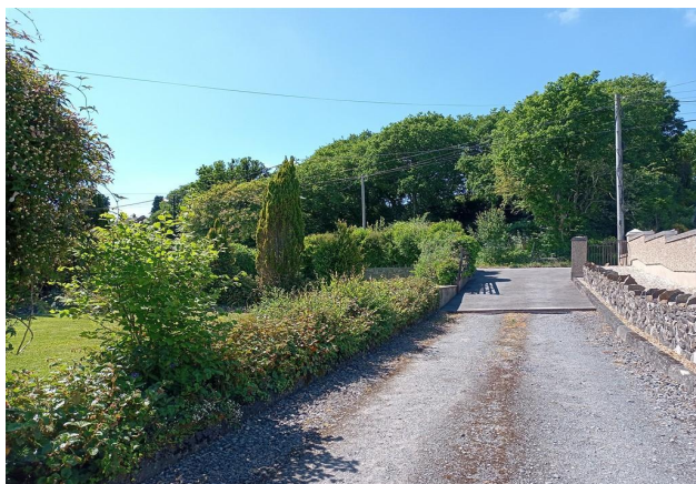
View To Front Of Property