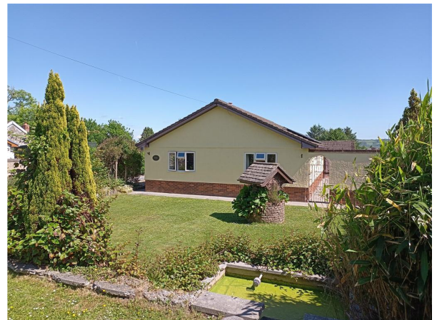
Close Up Front View