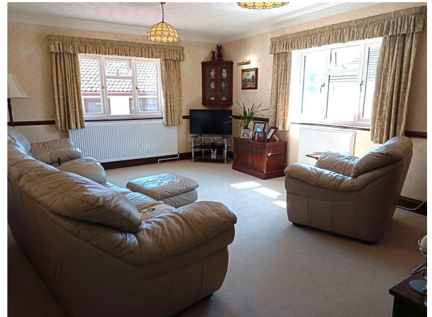
Lounge - View 2