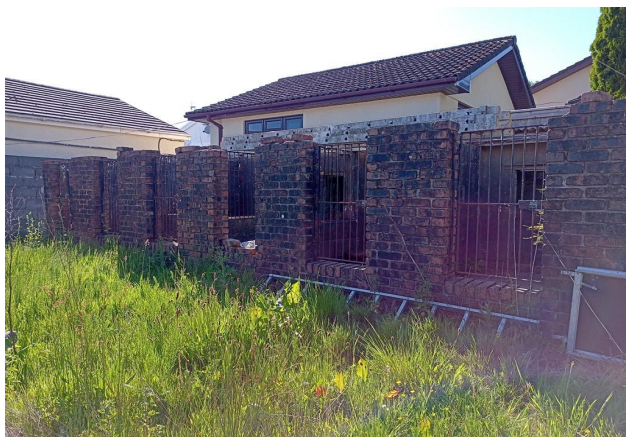
Six Dog Kennels