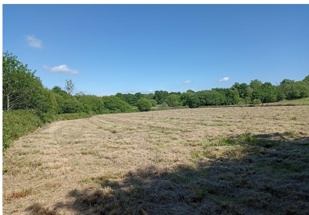
The Land - Just Under 11 Acres