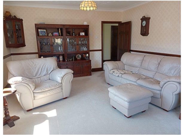
Lounge - View 1