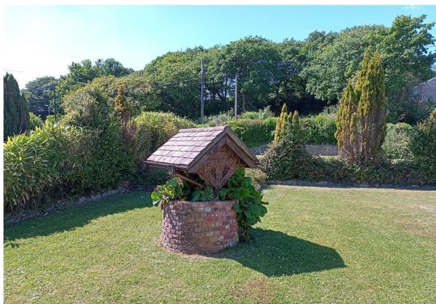
View From Bedroom 2