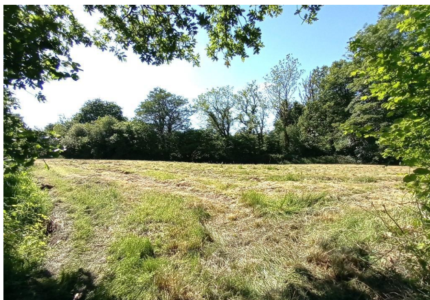
The Land - Just Under 11 Acres