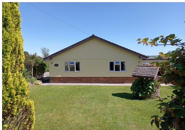
Bungalow And Front Lawns