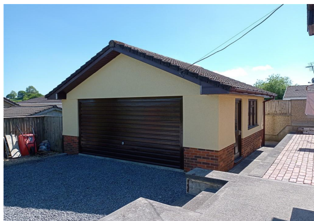
Detached Double Garage