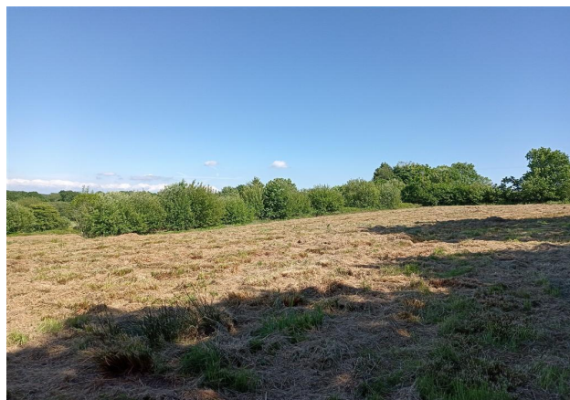
The Land - Just Under 11 Acres