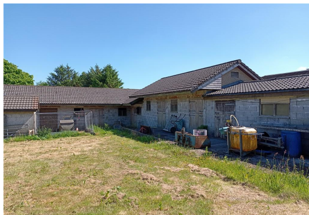
Large Double Skinned Stable Block