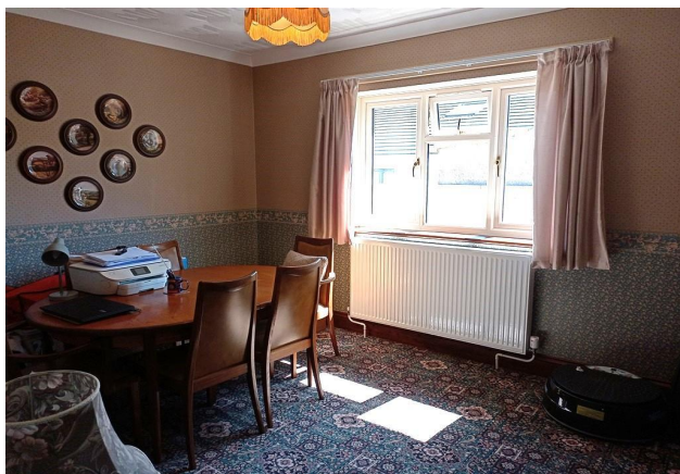
Bedroom 1 (Used As A Dining Room)