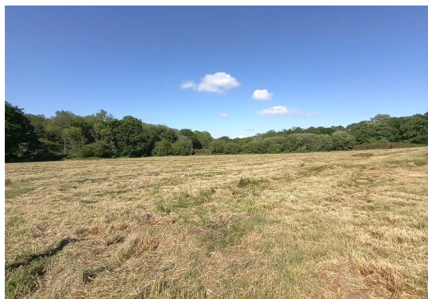
The Land - Just Under 11 Acres