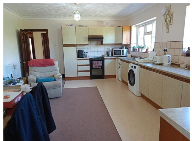
Kitchen / Breakfast Room