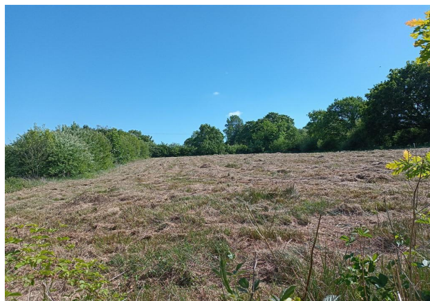
The Land - Just Under 11 Acres