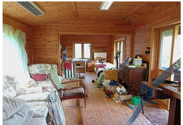
Inside Timber Cabin