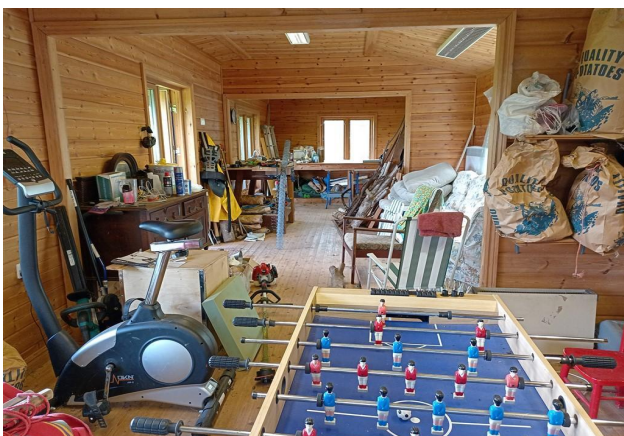
Inside Timber Cabin - View 2