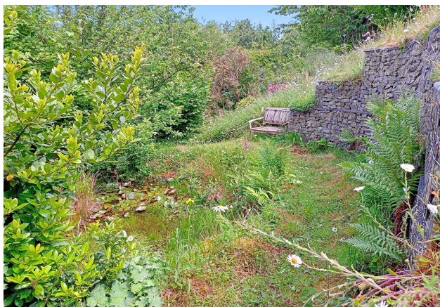
Second Wildlife Pond