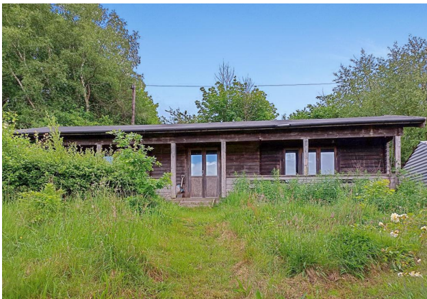
Large Timber Cabin