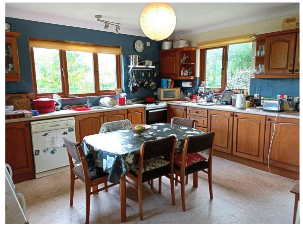
Kitchen / Diner

The Land - The whole site amounts to some 6 acres (see attached land plan) or thereabouts and is predominantly rough pasture (our client no longer keeps stock on the land so it is a little unkempt) and is gently sloping with a convenient gated access onto the road (so 2 gated access