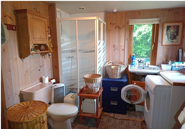
Second Shower Room