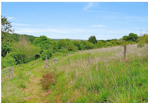
Land And Views