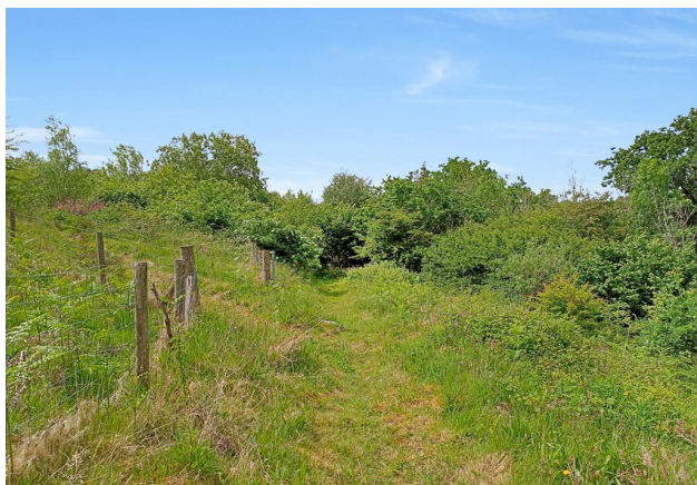
Land And Views