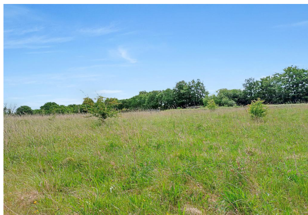
Another View Of Main Paddock