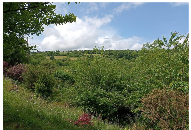
Land And Views