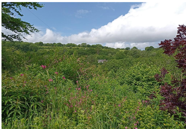
Land And Views