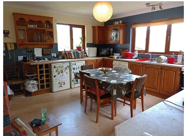
Kitchen / Diner - View 2