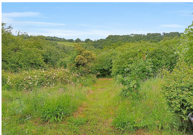
Land And Views