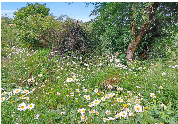
Wild Nature !!