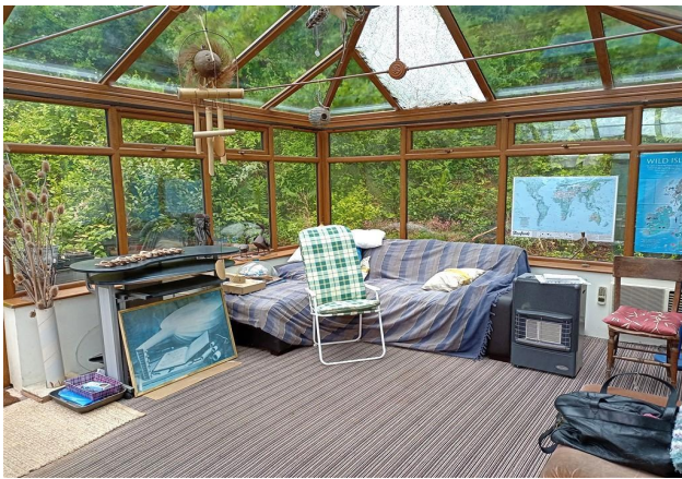
Conservatory - Another View