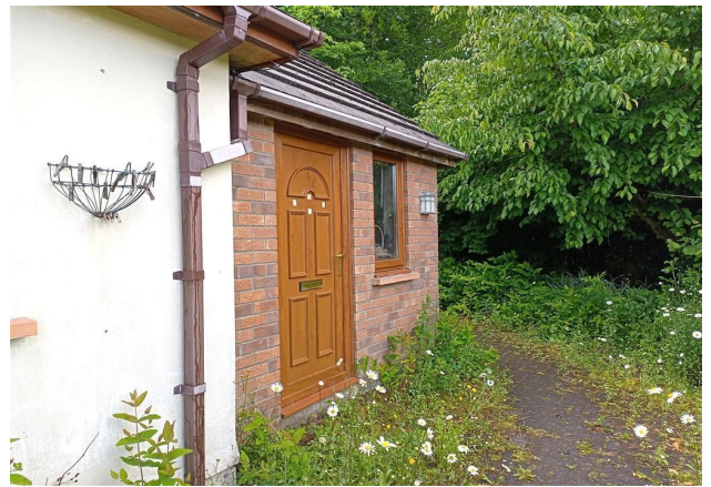
Separate Entrance To Possible Annex