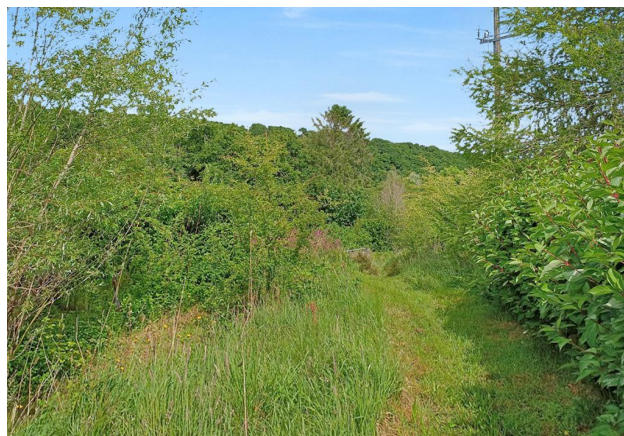
Land And Views