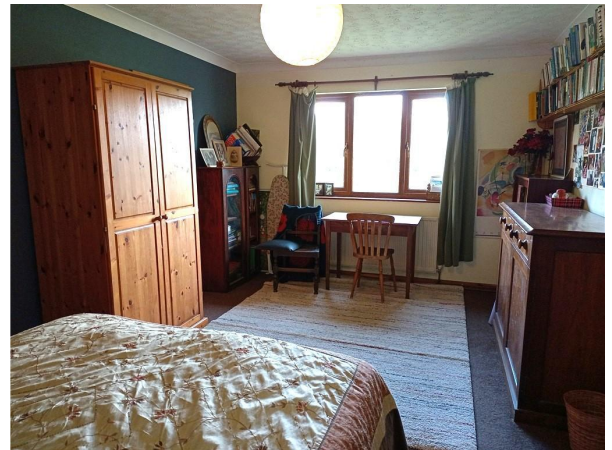
Master Bedroom - View 2