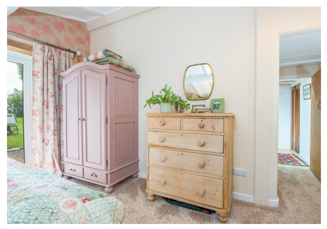
Master Bedroom - Other View