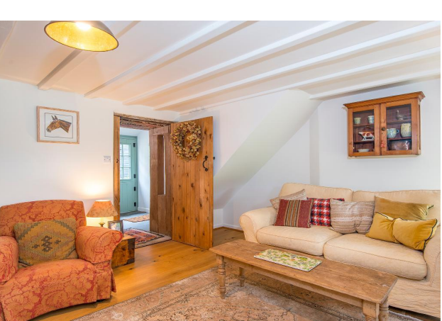
Lounge - Other View