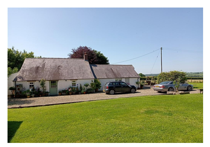
Front View & Parking