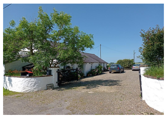
As You Arrive .....