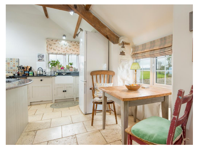
Breakfast Area In Kitchen