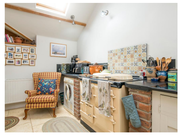
Electric Aga In Kitchen

Directions - From Newcastle Emlyn, take the B4333 towards Conwyl Elfed. Proceed for 4.5 miles and then take the right-turning sign-posted Trelech/St Clears (B4299). Proceed through Bryn Iwan and on, past the left turn for Blaenycoed and past the left turn for Talog. Take the left turn sign-posted Trelech (staying on the B4299). Proceed into the village and carry straight on up the hill (dont turn left in the square towards Meidrim) , pass the right hand turning for Dinas and continue on and Blaen Einon is the 3rd property on the right-hand side denoted by our for sale board. Google Co-ordinates: 51.92904814447281, -4.515996784619666 What3Words: ///abandons.tumble.extra