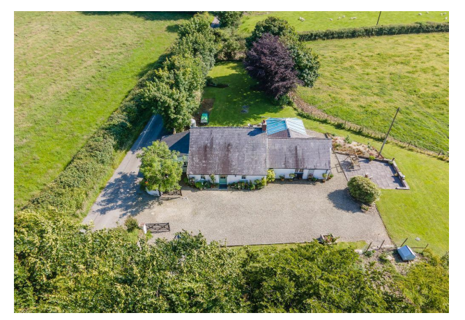
Aerial View 2