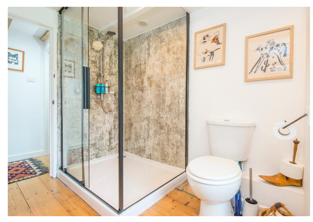
Shower Room - View 2