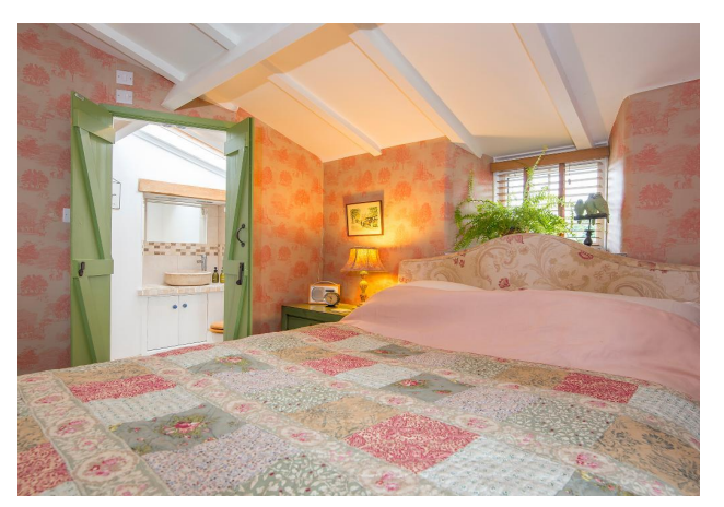
Another View Of Master