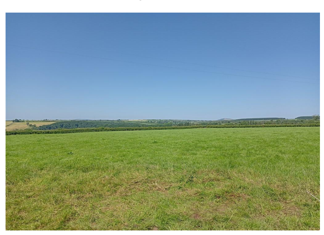
Far Reaching Views