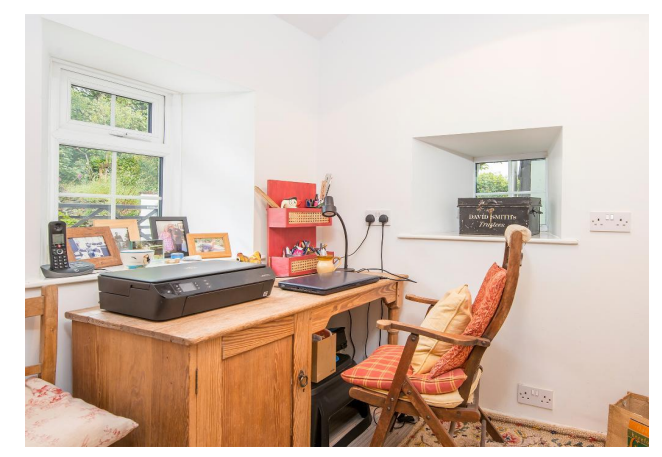
Study / Home Office