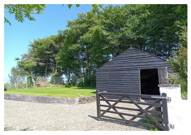
Garage / Workshop