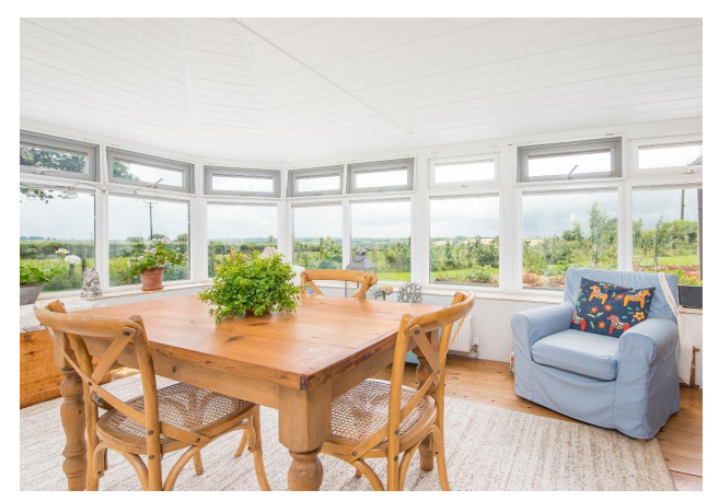
Conservatory / Dining Room