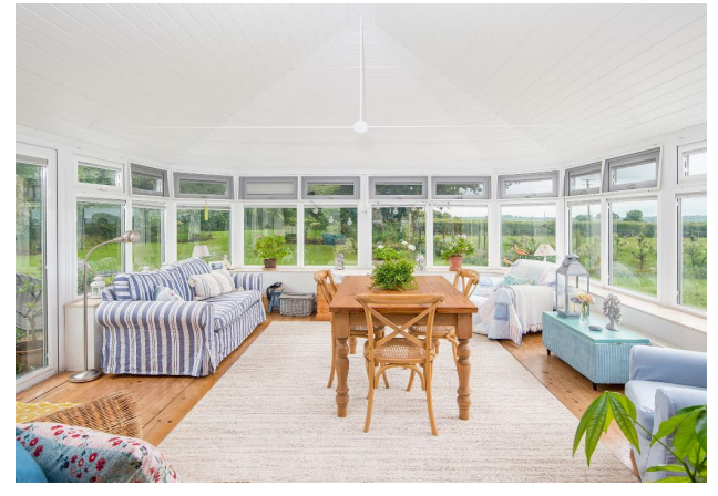
Conservatory / Dining Room