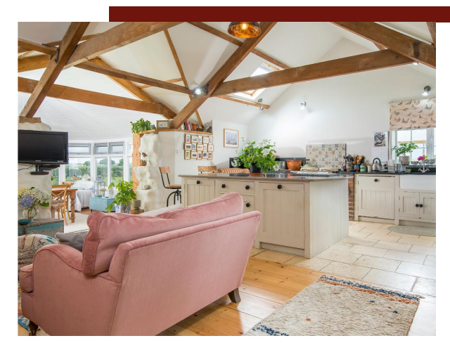
Kitchen / Sitting Room

First Floor - Accessed via staircase in entrance hall and giving access to: