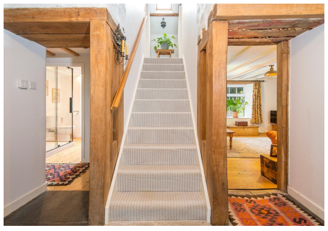
Staircase To First Floor