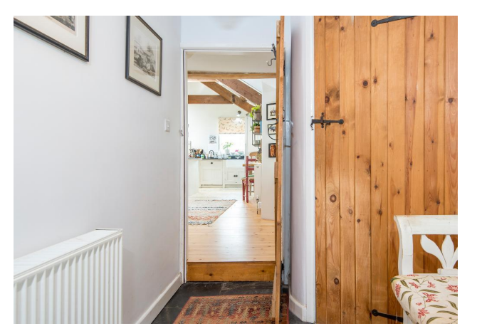
Hallway Looking Through To Kitchen